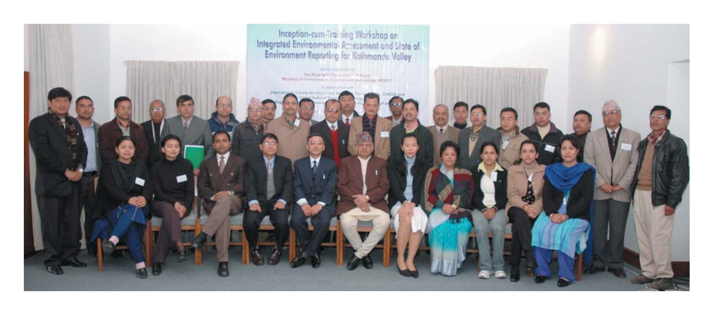
Annex 5 Inception cum Training Workshop on Kathmandu Valley Environment Outlook on the 21st-23rd December, 2005