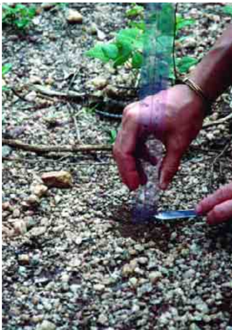
Figure 11.3: Detailed view of assessment of depth of armour layer