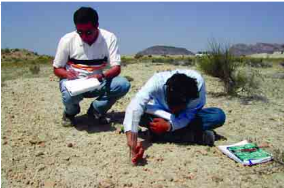
Figure 11.2: Measuring an armour layer in the field with farmer and researcher