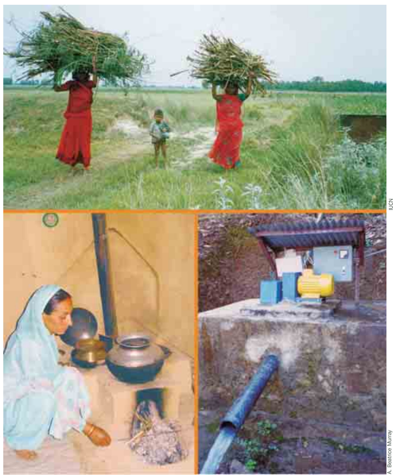
Rural energy past and future: clockwise from top-collecting firewood for cooking (top); a simple peltric set can provide electricity for lighting in remote villages; improved cooking stoves reduce firewood use