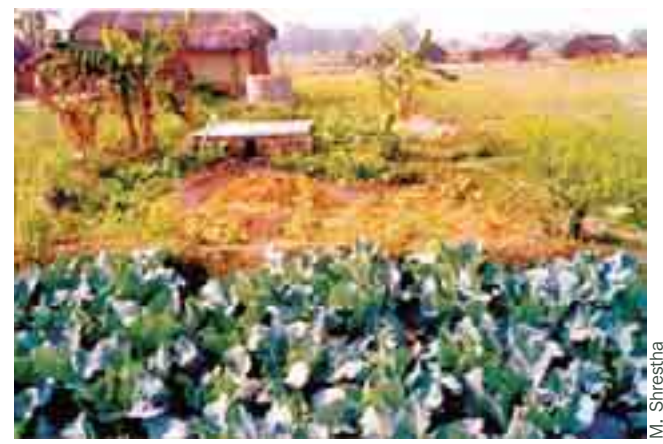
Ghatta, a water-powered mill

The electricity generated from micro-hydro has been used mainly for evening lighting. Thus, the peak