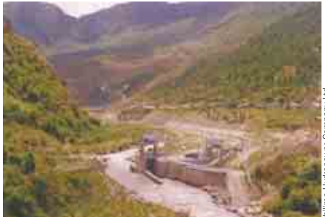
Chilime Hydroelectric Plant Headworks

Nepal's hydropower development has relied largely on imported technology and expertise. This situation is obviously undesirable in the long run. Capability is needed in all fronts of hydropower development, including planning and design, construction and management, and manufacturing hydropowerrelated plants and accessories. Although national capability has been developing and smaller projects are now being constructed with experts and