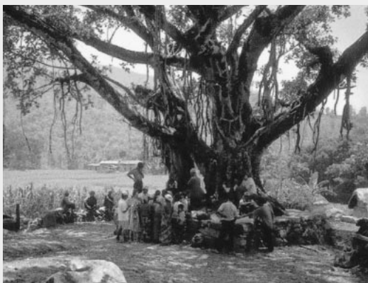
Most discussions, aerial photographic interpretation, and mapping sessions were conducted at stone platforms known as chautaara .