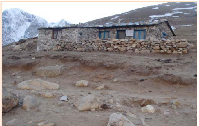
Porter rest house in Lobuche

The porter rest house in Lobuche is running very well despite the constraints and limitations. KACC has been strengthening this program to continue providing a comfortable and safe place for porters to stay while trekking in the Mt. Everest region. This rest house provides shelter, blankets, and cooking facilities to porters, so that they are not forced to burn fragile alpine shrubs for warmth and cooking, or to sleep in caves in Lobuche.