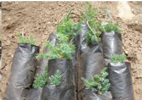
Seedlings collected from bed