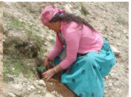
Planting in the denuded areas