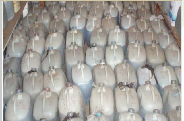
Kerosene stock at KACC Office

KACC, with support from The Mountain Institute and UNDP/SGP, has provided kerosene to local people, hotel and lodge owners, and trekkers since 2004, with the objective of reducing pressure on the alpine forest and vegetation through the use of kerosene as an alternative to firewood. At present, Dingboche Kerosene depot is operating with 4000 litre of kerosene in stock. The local people, trekking groups, and lodge owners operating above Shomare benefits from this kerosene depot. The depot is also a potential source of operational support for KACC.