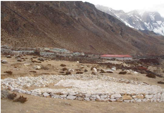
Newly constructed helipad in Dingboche