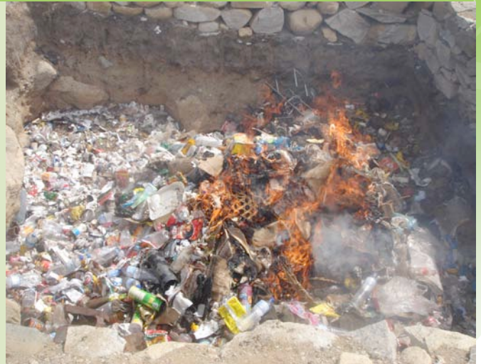
Refuse Disposal Pit in Dingboche

With help of local people, KACC has collected an approximately 20000 Kgs of waste. Non-biodegradable refuse has been disposed of in the refuse pit, and all the biodegradable refuse has been burnt. The local people including the lodge operators stressed the need for continuity of this kind of program in the future. KACC is also coordinating with other line agencies to ban the cans and the bottles in the coming year in inside the project area.