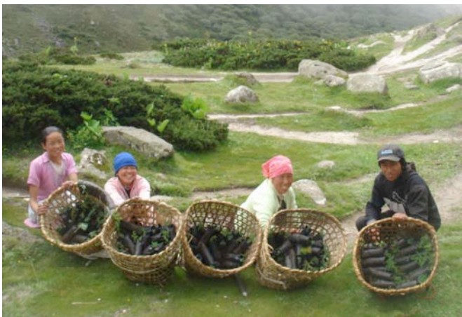
Seedlings ready for distributions