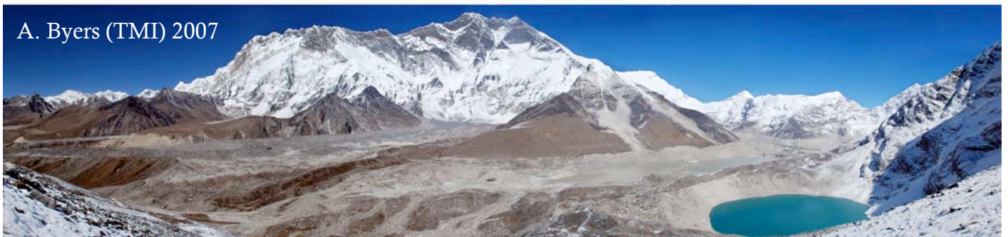
A. Byers (TMI) 2007

KACC, with local line agencies, has conducted a one-day workshop on climate change issues with local people, including lodge operators. The kinds of threats presented by climate change, and the mitigation strategies adapted by the national and international groups were discussed. This workshop was conducted before the Government planned to hold the highest cabinet meeting at Everest Base Camp on 4 th December 2009.