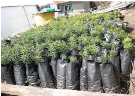
Seedlings in the nursery bed

KACC distributed a total of 5000 seedlings of multipurpose alpine species such as the Juniper, birch to the local farmers of Dingboche, Pheriche and Shomare. These seedlings were produced from the nursery established at Shomare at 4000m. This has become one of the highest nurseries established in Nepal and the first of its kind in the Khumbu region. Seedling distribution to individual farmers will encourage them to plant in their private lands as well as the area where the land has been denuded due to over-grazing and/or over-harvesting of alpine shrubs for fuel wood use.