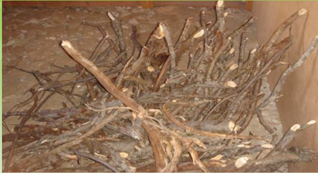
Illegal harvested juniper by local herders