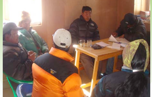
New Executive Members