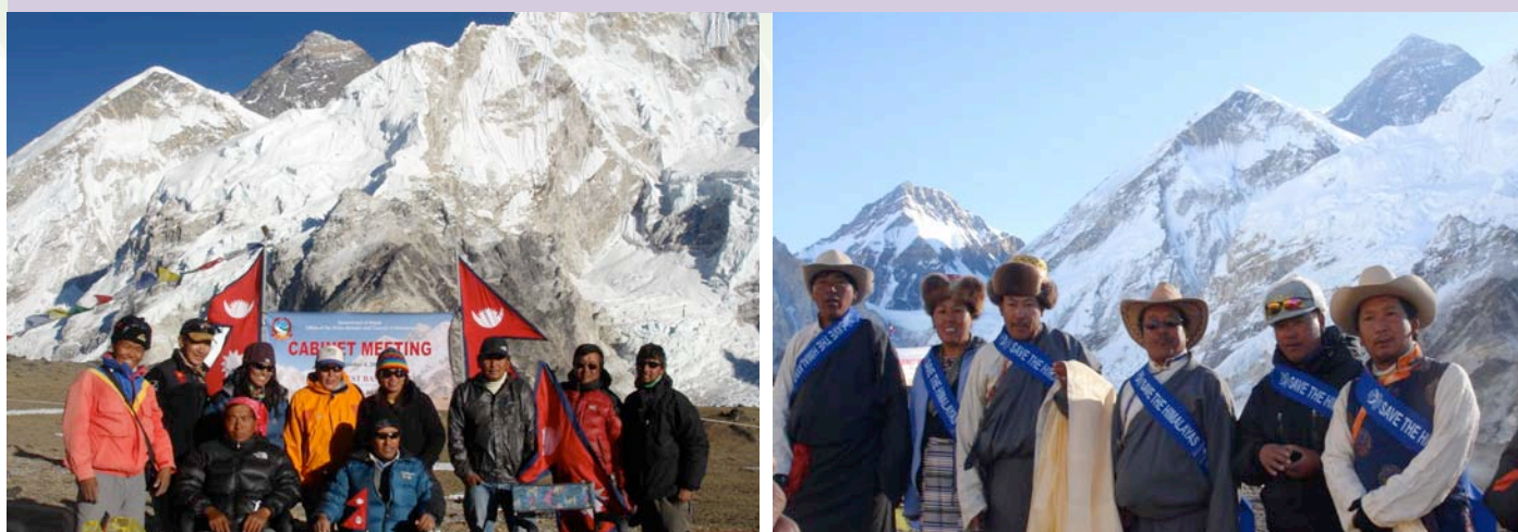
Executive Members of KACC welcome the cabinet meeting held at Kalapathar on 4 th December 09

KACC helped organize the historic cabinet meeting held at Kalapatthar plateau near Everest Base Camp (5,242 meters) on 4 th December 2009. At the meeting, the cabinet issued a 10-point "Everest declaration" which calls for concerted actions to minimize adverse effects of climate change in the Himalayan region. In the 10-point declaration, Nepal expressed commitment to working with the international community to mitigate threats presented by climate change, including the preservation of bio-diversity and natural heritage, and to work towards sustainable socio-economic and cultural development of mankind.