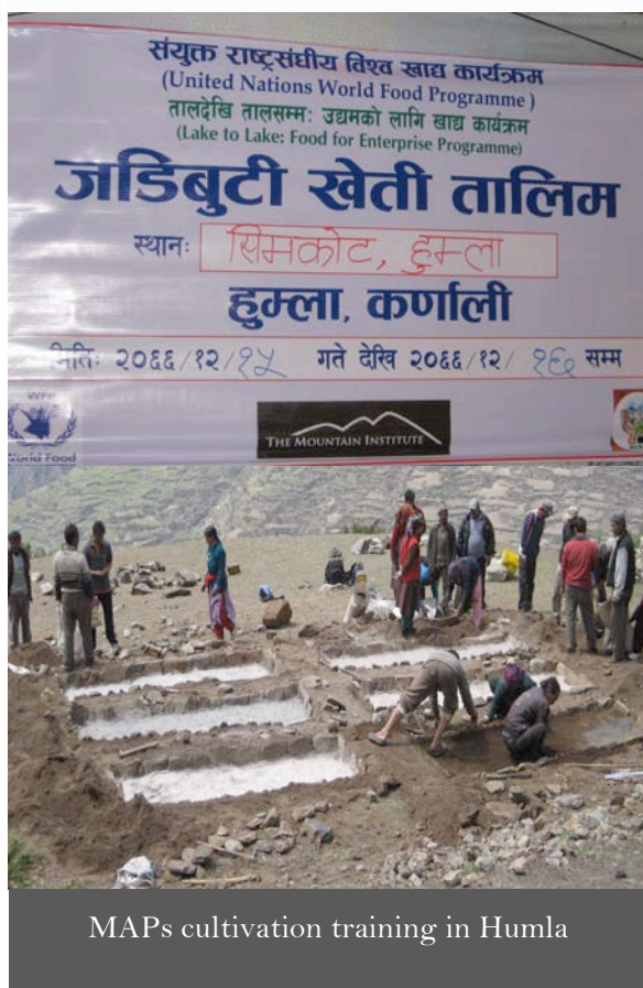
MAPs cultivation training in Humla