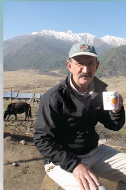
Director in the field