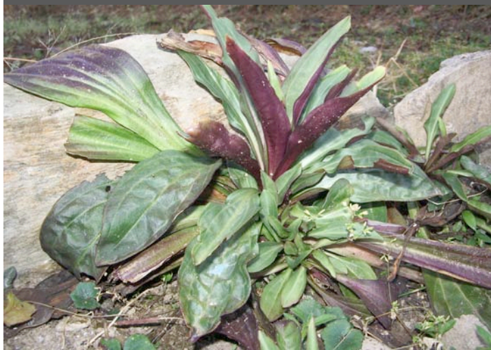
Chiraito ( Delphinium himalayai Munz) in Dhading

The Mountain Institute has received a one-year grant from Pro-Victimis Foundation (PVF) objective to strengthen livelihoods and conserve natural resources in Rasuwa and Dhading districts by training local farmers in MAPs cultivation and to strengthen the skills and organizational capacity of farmer groups to operate effectively in market.