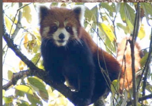
Visitors from Hongkong enjoying Red Panda Habitat