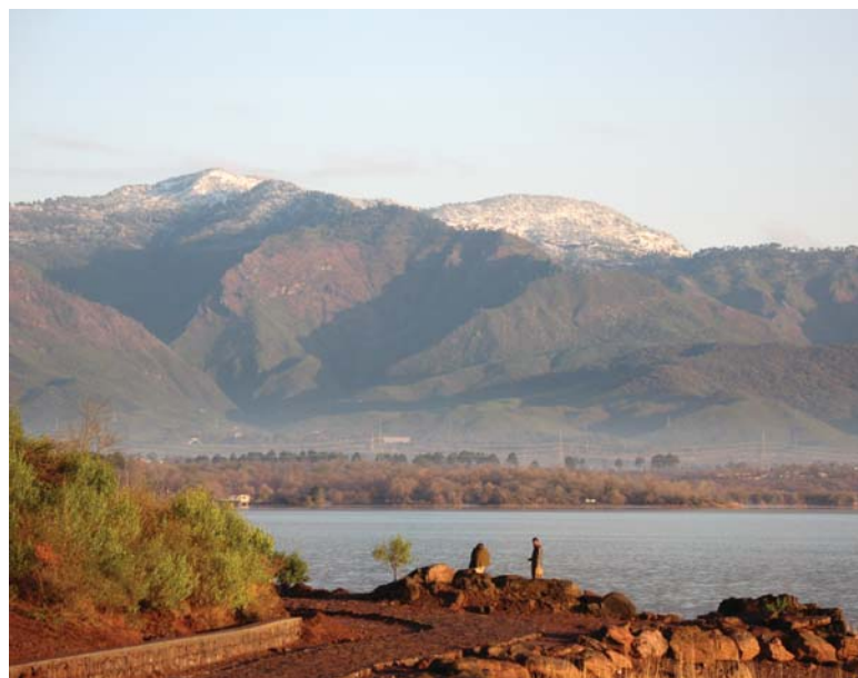
The Margalla Hills National Park.

Natural areas such as national parks benefit society in numerous ways. Not only do they perform ecological functions, they also provide recreational amenities to