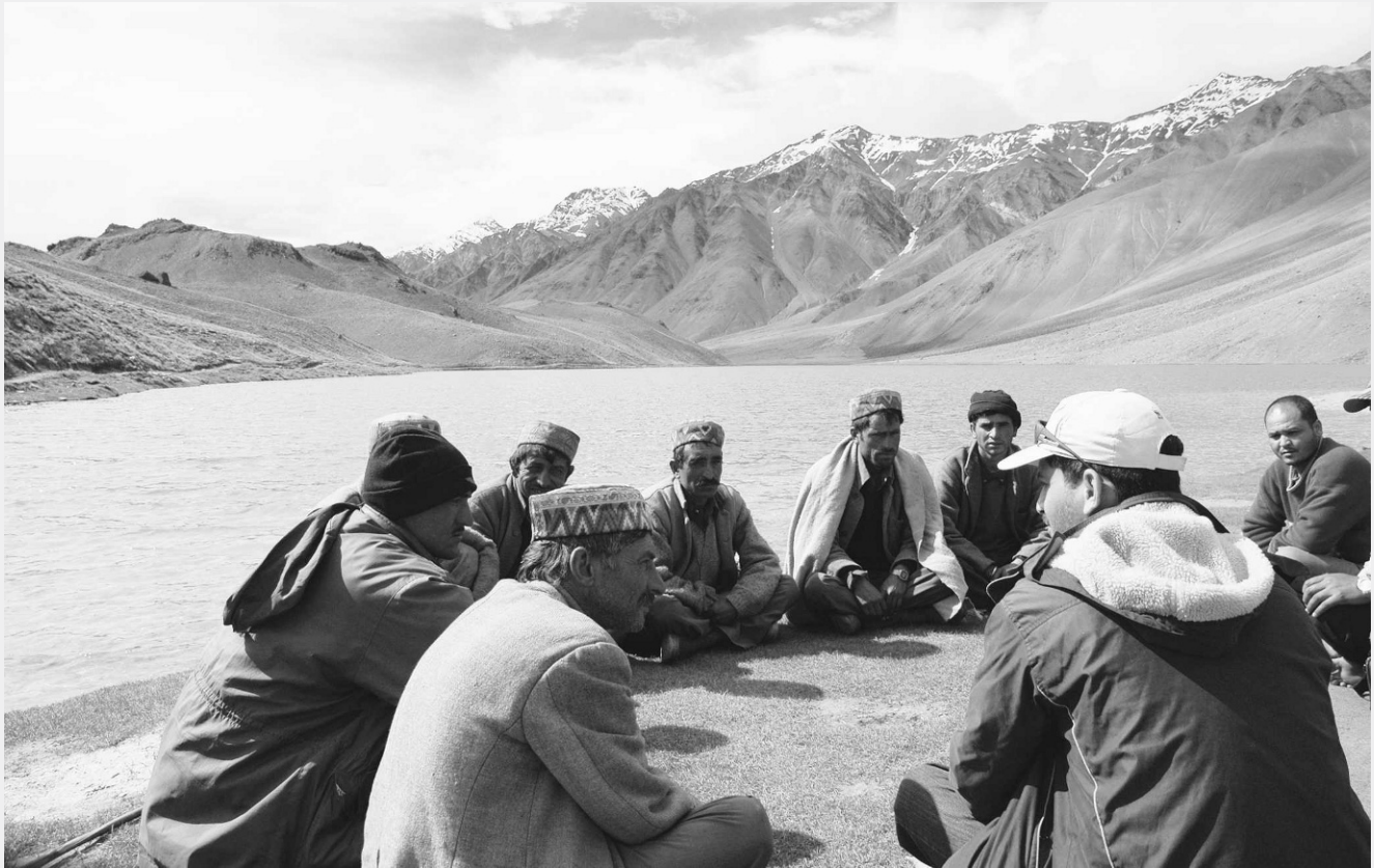
FIGURE 5 A group of local people discussing conservation issues on the banks of Chandrata Lake, Himachal Pradesh, India.

Lakes, permafrost and wetlands play a great role in regulating lateral flow of rivers. The increased air temperature results in earlier melting of the frozen soil and increased soil evaporation. This results in a decline in the groundwater table and water levels of the lakes, which reduces water supply of baseflows from groundwater and lake water. The water resources in the region declined between 1956 and 2004 due to the above changes. In addition, in some parts of the Yellow River, sources were converted from grassland to cropland, which adds to the problem.