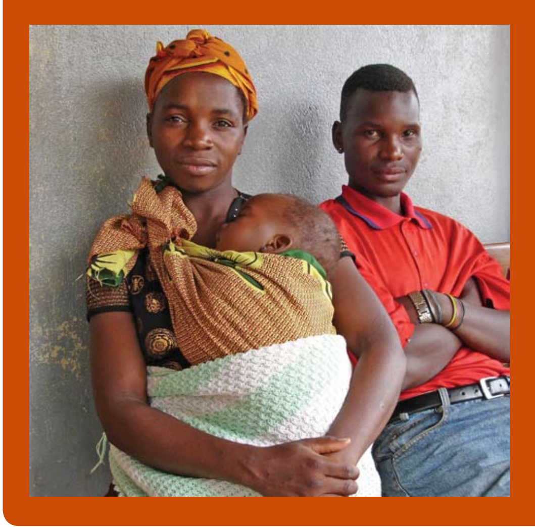
Photo: Proud Mum and Dad after a routine checkup at Machase District health clinic in Mozambique. Mother and baby are in good health.

Mozambique needs significant additional financial support to make health care free and to address the severe health worker shortages. Estimates suggest, in the first instance, an additional US$10 million per year is required for user fee removal and to make medicines free,<sup>57</sup> with further increases necessary to fully implement Mozambique's already fully costed health worker strategy. A US$10 million increase constitutes a 25% increase in national government spending on health as compared to an insignificant 2.5% increase in current levels of aid for health in that country. Despite being a signatory to the International Health Partnership,<sup>58</sup> under which aid donors have committed to scale up funding for national plans, no action has been taken to date to fill this identified financing gap.