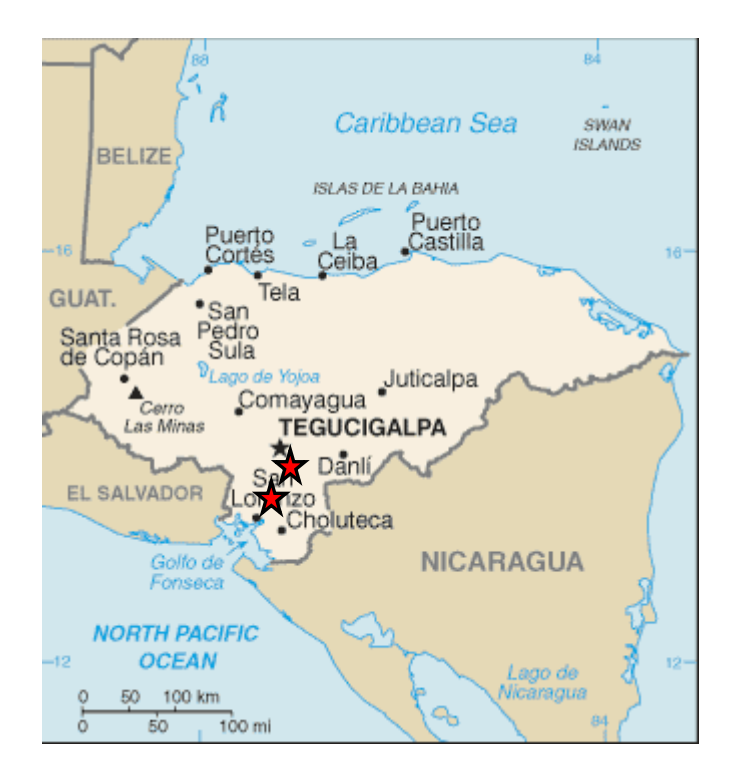
Figure 1: Map of Honduras and Project Areas of Lepaterique (upper star), and Pespire (lower star).

In order to gain experience for HEKS as a whole, Marius Keller, a consultant, carried out 2 climate proofing assessments in Honduras, in March and April 2009. The analysis was conducted in two community-level projects operated by local NGOs in the South of Honduras. Both have been receiving support from HEKS over the past few years. People in project areas are very poor, and, as the subsequent analysis will show, very vulnerable.