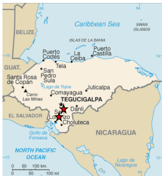
Figure 1: Map of Honduras and Project Areas of Lepaterique (upper star), and Pespire (lower star).

In order to gain experience for HEKS as a whole, Marius Keller, a consultant, carried out 2 climate proofing assessments in Honduras, in March and April 2009. The analysis was conducted in two community-level projects operated by local NGOs in the South of Honduras. Both have been receiving support from HEKS over the past few years. People in project areas are very poor, and, as the subsequent analysis will show, very vulnerable.