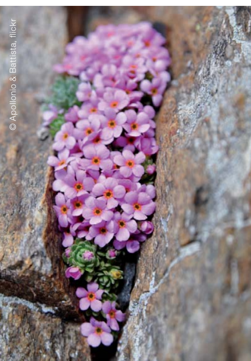
Figures 1 and 2:

Extreme high altitude species, Ranunculus glacialis (left) and Androsace alpina , according to the results of the research project Gloria are already displaying a retreat today.