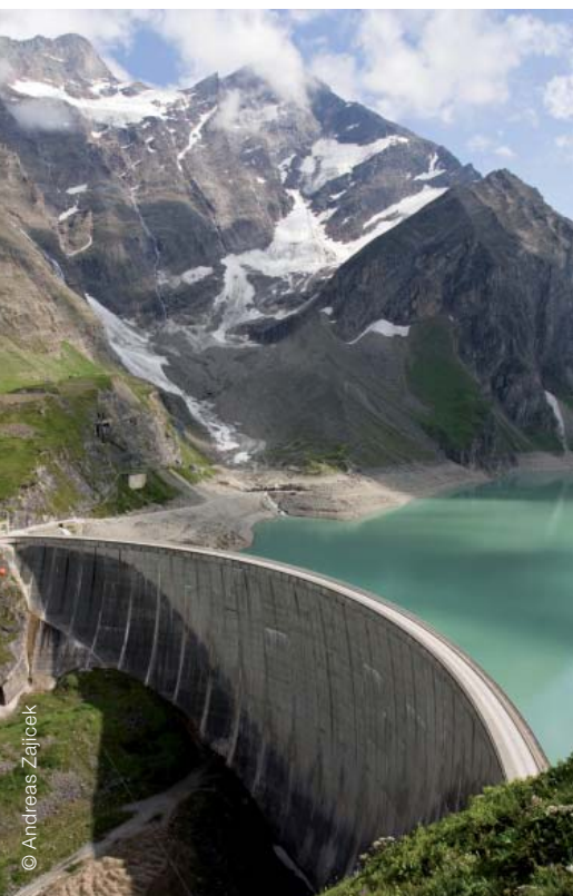
Figures 9 and 10:

Since high water events become more frequent as a consequence of climate change, more extensive adaptation measures are necessary. If hydraulic engineering measures are taken, which considerably change the natural water flow (straightening, riparian control structures, channeling projects), there are conflicts with the protection of the ecosystems of the watercourses. For a sustainable high water protection – particularly as regards climate changes – restraint spaces must be preserved and the necessary space along rivers must be ensured. From an economic viewpoint it is more cost-effective to take such prevention measures than later to reimburse high water damage to buildings and infrastructures (SCNAT 2008).