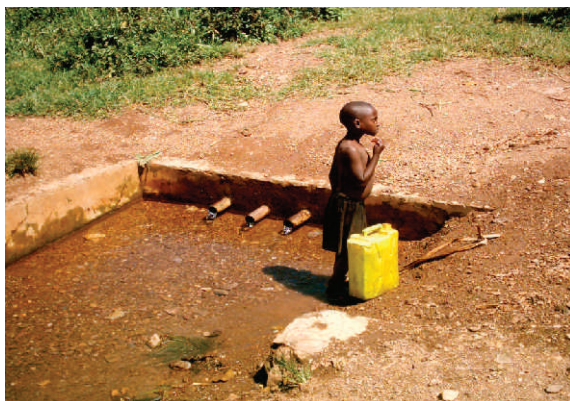
FIGURE 3 Poor maintenance: the immediate surroundings of this protected spring are not maintained. This affects both water quality and yield.