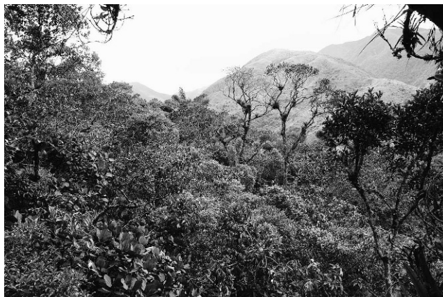
FIGURE 2 Loja, Ecuador: a typical example of an Andean montane forest.

to account for the potential impacts of climate change (Vuille et al 2008), developments must go hand in hand with the implementation of measures and mechanisms that conserve and protect the natural ecosystem. Sustainable development measures, conservation, and rehabilitation require, among other things, knowledge about the hydrology of natural and altered ecosystems and about relationships between the water system and anthropogenic and natural impacts. Given the importance of good understanding of the hydrology, the present article describes the state of the art of Andean páramos and forests (Figures 1, 2, respectively), based on a review of international literature, primarily related to Ecuador. The review is further used as a basis for the formulation of recommendations to enhance investigation of the hydrology of Andean wet ecosystems.