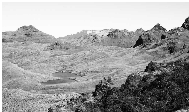
FIGURE 1 El Cajas National Park, Ecuador: a view of the páramo .

Andean region becomes increasingly altered that attention is converging on this high-altitude water supply system (Buytaert et al 2006).