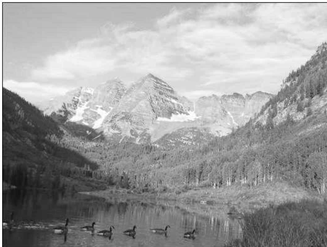
FIGURE 1 The Maroon Bells in the Elk Range near Aspen, CO, are a signature for the pristine alpine beauty of Colorado's Fourteeners. (Photo by Jon Kedrowski, August 2006)

study was performed by members of the Rocky Mountain Field Institute (RMFI) in the Sangre de Cristo Range of southern Colorado addressing the restoration efforts on Humboldt Peak (Hesse 2000). The information presented in the case of Humboldt Peak provided a good overall physical description of what is occurring on all of the Fourteeners. However, the study failed to directly address values indicating climber-visits to Humboldt Peak.