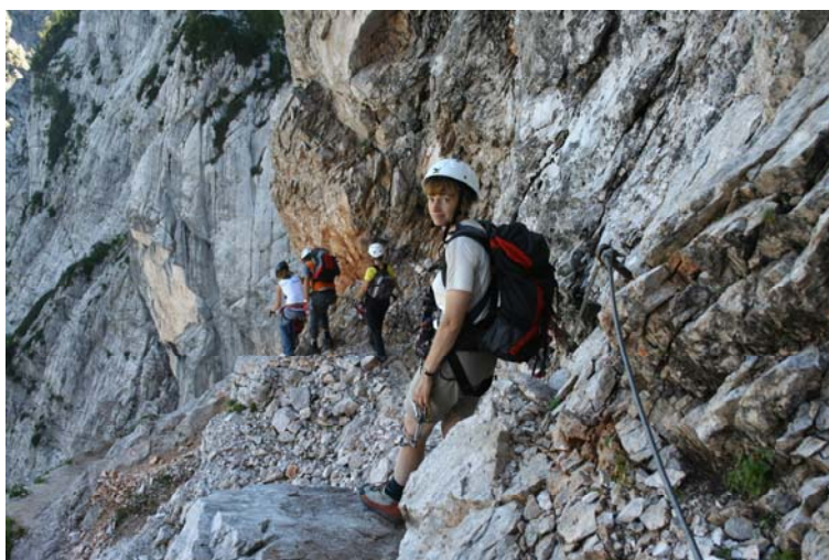
FIGURE 1: High elevation mountaineering routes in Slovenia are very well maintained.

Slovenia is one of several alpine countries, and a considerable portion of its territory is mountainous. It is thus not surprising that mountaineering is highly developed. It is part of the general culture of the Slovene nation and is fostered by a range of geographical factors and processes which have unfolded in Slovene territory from the mid-19 th century until the present time. The Alpine Association of Slovenia represents one of the largest mass membership organizations in Slovenia. Research has shown that in 2001, 15.7% of the population took part in mountaineering activities. The Alpine Association of Slovenia estimates that the mountains of Slovenia are frequented by more than 3 million visitors, which is 50% more than the population of Slovenia itself (2 million). With respect to mountain hiking trails, Slovenia stands out in the world, with 1446 trails having a total length of more than 7000 km. This means 0.35 km of path for every square kilometer of area in Slovenia (Figure 1).