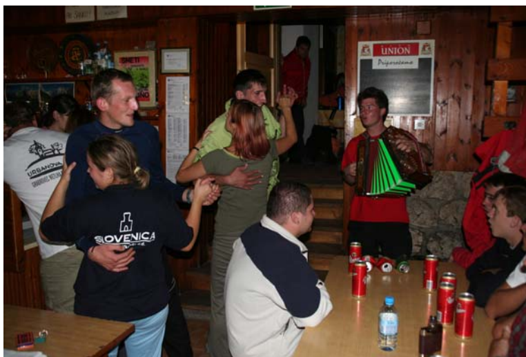
FIGURE 3: Social evenings with accordion music so popular in the past have today become a rarity.

In the past people, due to reliance on buses for transportation, were compelled to overnight in mountain hostels to a greater extent than today, when they can drive their cars to the mountains and do a mountain hike in one day. At the same time they are more inclined towards a day trip also because they have less leisure time, due to the demands of a market economy, than was typical under socialism, and because the trip itself costs less. The social evenings that used to be common in mountain hostels are now practically nonexistent (Figure 3). The number of overnights in hostels is thus significantly lower than in the past, even though the facilities for guests are much better than they used to be.