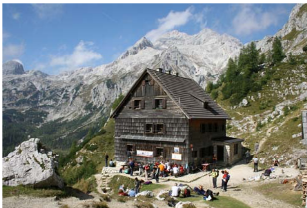
FIGURE 2: Today there are a large number of overnights especially at mountain huts in the Triglav area. Pictured is the hut Vodnikov dom.

All this was also reflected in the decreased number of overnights in mountain hostels, and consequently also in the decreased number of members of mountaineering clubs (Figure 2).