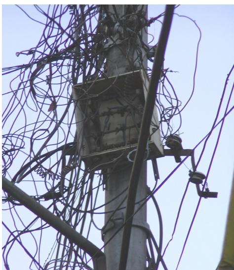
An overburden Distribution Line

Excessive distribution loss has made the cost of electricity high; but it is pilfering by individuals and groups that has caused the honest user to suffer. Due to this theft, electricity supply services to rural persons is not accessible nor it is cheaper as compared to urban areas, when the tariff is same for both. Similarly, the prospects for extending rural electrification using existing overburdened power sources are not encouraging to NEA, as it is a commercial entity. Irrational decrease and increase in demand of rural electricity, in both peak and off-peak hour leads to low return and high service costs. Further, investment and management inefficiencies plus rural electrification often awarded as political favors, lead to inefficient service and less growth in coverage.