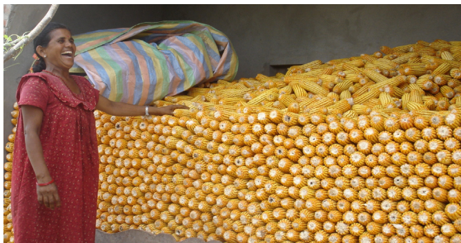
Prosperity through Irrigation

it is necessary to convert available water resources into electric power, which will play an important role in the overall development of the country. Urban people are major consumers of the current electricity supply, whereas the majority of country's population reside in rural areas. Many agro-industries, irrigation and cottage industries are focused on rural areas. The country's overall development depends on development of rural area. Therefore, regional development is possible only through equitable consumption opportunity of electricity in urban and rural areas alike.