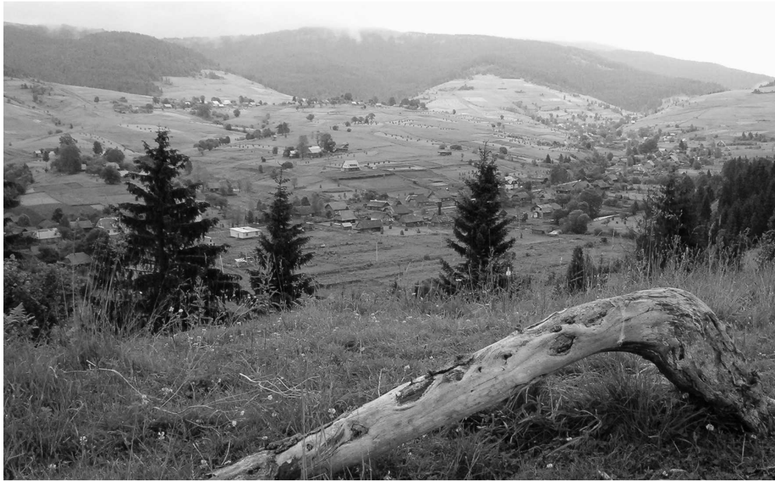
FIGURE 4 The village of Volosyanka in Ukraine, 2007: ecosystem services in the Carpathians are a basis for traditional cultural landscapes.