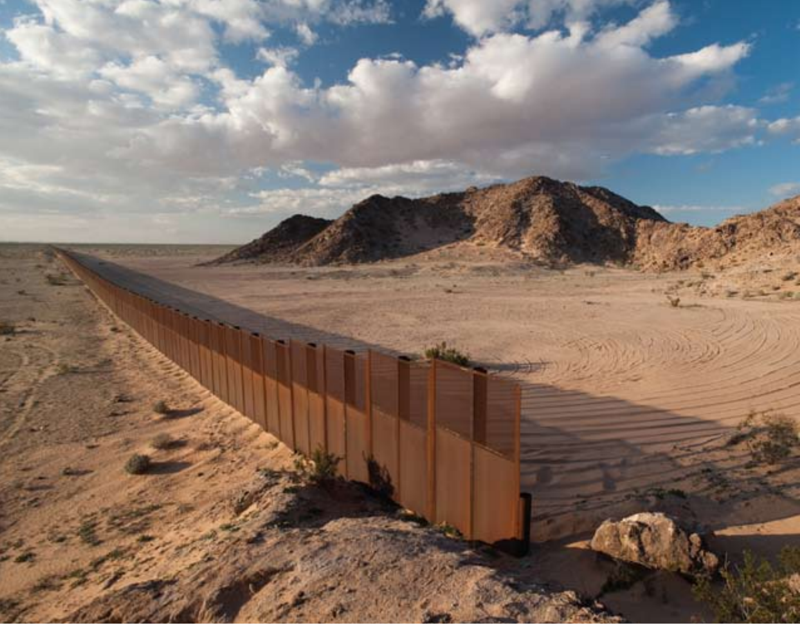
A 15-foot wall of steel in southwestern Arizona blocks passage for wildlife along dozens of miles of dry desert landscape, keeping imperiled species from reliable year-round water sources found on one side of the wall.

For more information on this issue and to learn more about borderlands ecosystems, visit: