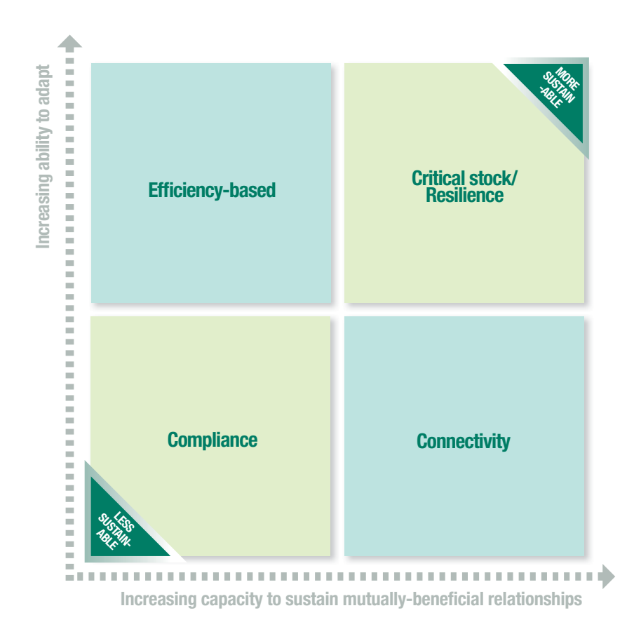
Figure 2: The SCP Compass