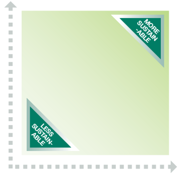
Figure 3: Characteristics of more sustainable systems

By using the compass, policy-makers and relevant stakeholders will be drawn to reflect on the story that underpins their indictor set. They will be prompted to ask whether their indictor set establishes a driver towards a more sustainable society through the development of adaptive capacity. This is the "individual narrative" that must inform efforts to develop a set of realistic indictors that track the actions of government agencies, producers and consumers, as well as the longer term effects on the natural capital base that sustains their efforts.