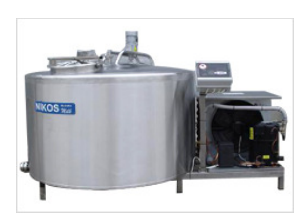
Figure 3: Milk cooler

Cooling does not destroy bacteria or enzymes but it slows down their activity. Cooled raw milk keeps its quality for a few days before it is processed. Milk products such as yoghurt, cheese, butter and pasteurised milk are also cooled to ensure they have the required shelf life for distribution to shops and retail storage. At the smallest (micro-) scale of operation, a refrigerator set at 4-5°C can be used to cool milk, but most dairy processors use a milk cooler (Figure 3) or cold store to cool milk in bulk before it is processed. Finished products should be stored in a separate dispatch store at 4°C +/- 2°C, or for frozen milk and ice cream, frozen in a freezer operating at below -18°C.