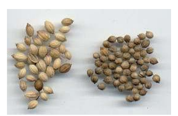
Figure 2: Coriander seed. (http://www.uni-graz.at/~katzer/engl/Cori_sat.html)

Harvesting at the correct stage of ripeness is essential for the coriander seed to have a full aroma. Under-ripe coriander seeds have an unpleasant flavour and lack the distinctive spicy aroma and over-ripe seeds (after about 90 days from planting) tend to shatter which reduces the yield. Since ripening is progressive on the plant, harvesting should take place when between half and two thirds of the seeds are ripe. To minimise breakage, the plants should be cut during the early morning while the dew is on the plant or in the late evening. After harvest the seed is dried and stored for later use.