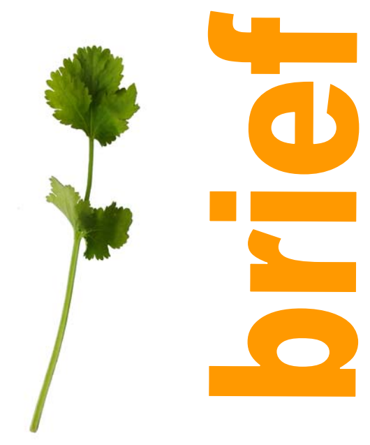
Figure 1: Fresh coriander

The leaves are used as a fresh green vegetable or salad leaf. Coriander seed oil is used for a range of medicinal applications. It has antibacterial properties and is used in treatments for colic, neuralgia and rheumatism. It has industrial applications in pharmaceutical applications and tobacco where it is used to counteract unpleasant odours.