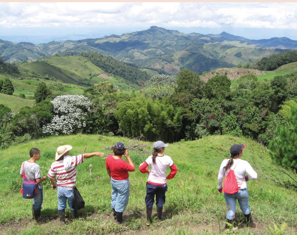
FIGURE 3 Research theme diagnostic, Génova, Colombia.

In parallel with the research process, workshops for the development of leadership skills were conducted. They focused on self-awareness, group affiliation, self-