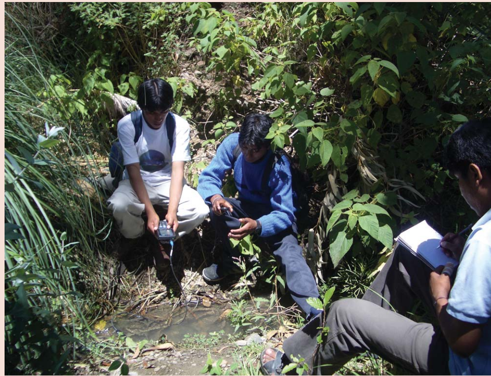
FIGURE 2 Water quality sampling, Tiquipaya, Bolivia.

A fundamental component of working on water-related issues in Bolivia is the socialization of projects with local communities and water user committees. After several town meetings and discussions with the irrigation users' committee, both communities agreed to support the project and youth groups were formed in the upper and lower watershed. Diagnostic workshops were conducted with local youth to discuss water issues in both communities and to design research questions that could help to solve those issues (Table 1). Activities were specified and undertaken in the 2 zones, including water source mapping, wetland coring, and greenhouse vegetable production in the upper watershed; water rights' analysis, computing and mapping of distribution systems in