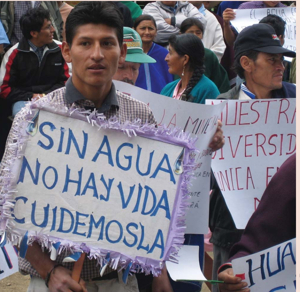
FIGURE 5 "Without water there is no life. Let's take care of it." Placard in Rio Blanco.

The primary objective of a water quantity study is to quantify potential effects of mine operations and facilities on surface water flow and flow from springs. Discharge should be measured continuously at the most important sites. A less expensive method for continuous measurements of discharge uses pressure transducers that are placed on the stream bottom. In both methods, a stage-discharge relationship needs to be developed for the specific locations using manual measurements of flow. Infiltration rates to the subsurface are estimated by collecting soil cores and testing them to learn how the soils in the study area store water and how water moves through them. Soil cores should be collected periodically from the tailings pile and the same measurements conducted to understand how much water may be infiltrating the tailings pile and flowing over the surface of the tailings pile.