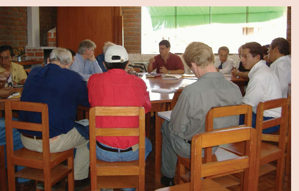
FIGURE 3 Consulting with stakeholders.

grande and a Canadian company, Manhattan Minerals. Manhattan departed shortly after a local referendum in which over 93% voted against mining. Meanwhile, Monterrico Metals was beginning exploration work in Piura's highland provinces of Ayabaca and Huancabamba. This elicited similarly severe conflicts. Two farmers were killed during protests, while different national and international actors became involved. This conflict also led to a referendum held in September 2007, and again, over 90% of voters were against mining. But the company, the central government, and the President of Peru continue to insist that the mine go