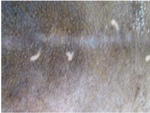
Figure 3. Irregular arrangement of tubercles along the lateral line in abnormal fish