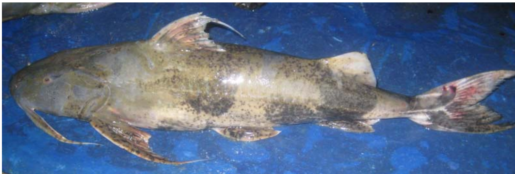
Figure 2. Normal fish