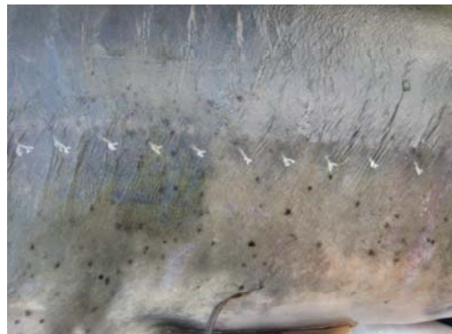
Figure 4. Regular arrangement of tubercles in normal fish