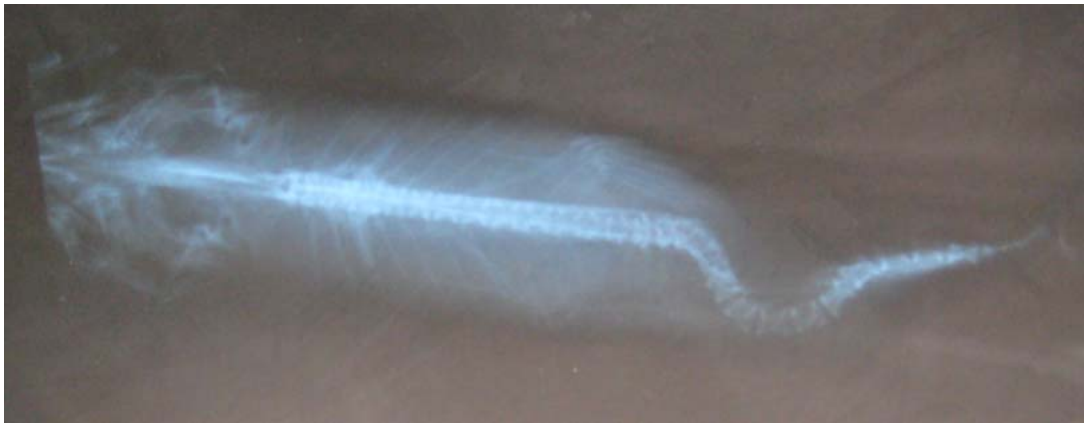
Figure 5. X-ray photograph of abnormal fish