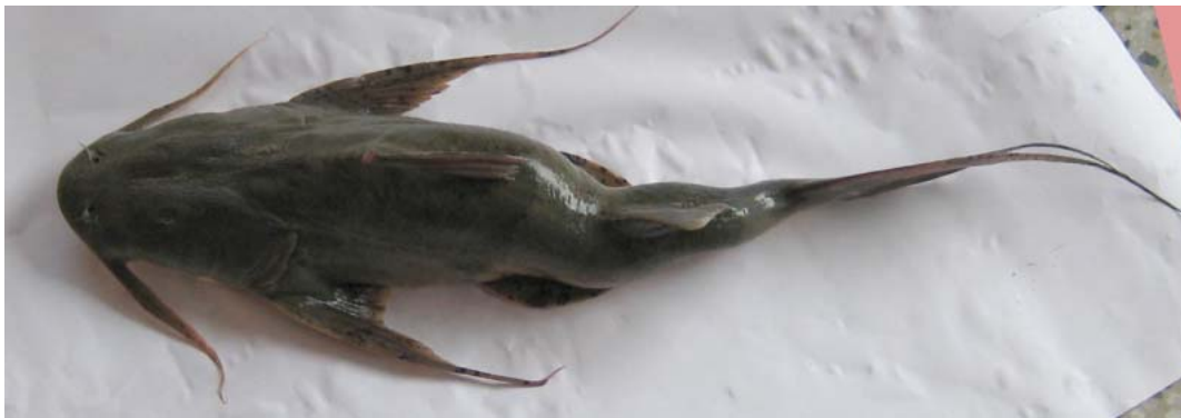
Figure 1. Abnormal fish