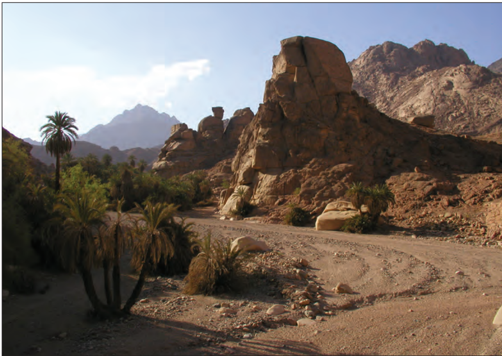
Plate 4. Wadi Kid

Wadi Itlah (1400–1520 m asl, 2006). Located close to St Katherine, Wadi Itlah is a narrow and long wadi system with scree slopes and extensive boulder fields. There are several Bedouin fruit gardens and small holdings with goats, sheep and donkeys, also a few carob trees and date palms outside of the gardens.