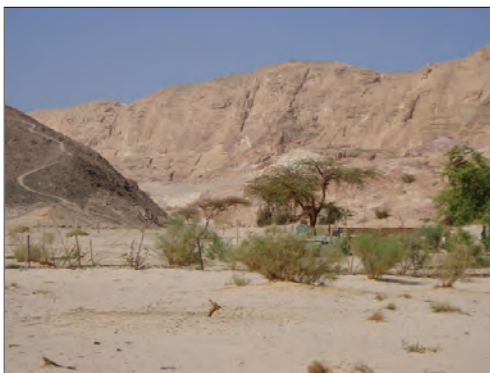
Plate 2. Ain Hodra