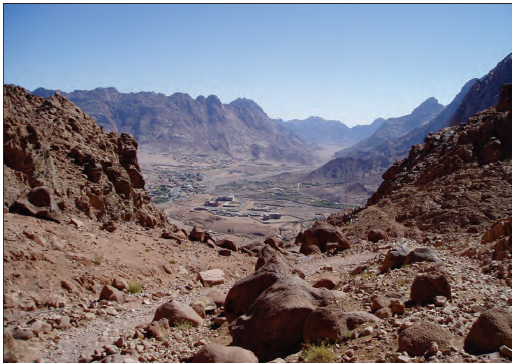
Plate 1. St Katherine City

Key: 2006: 1 = Wadi Nasb, 2 = Ain Hodra, 3 = Wadi Marra, 4 = Wadi Gharba, 5 = Wadi Gebel, 6 = Wadi Itlah. 2007: 7 = Ain Hodra, 8 = Sheikh Awad area (Wadi Sulaf), 9 = Wadi Kid, 10 = St Katherine City (2006 & 2007)