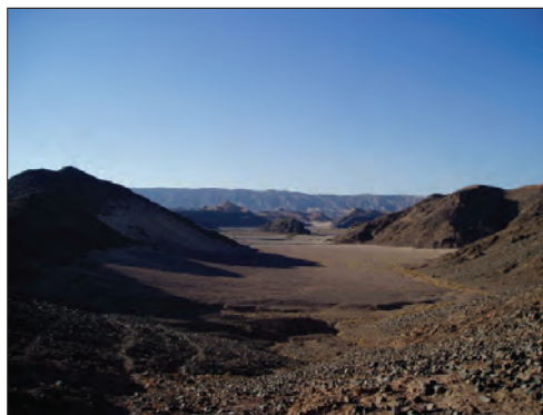
Plate 3. Wadi Marra

Road, St Katherine Monastery, Wadi Arbain) were repeated using the same methodology as 2006.