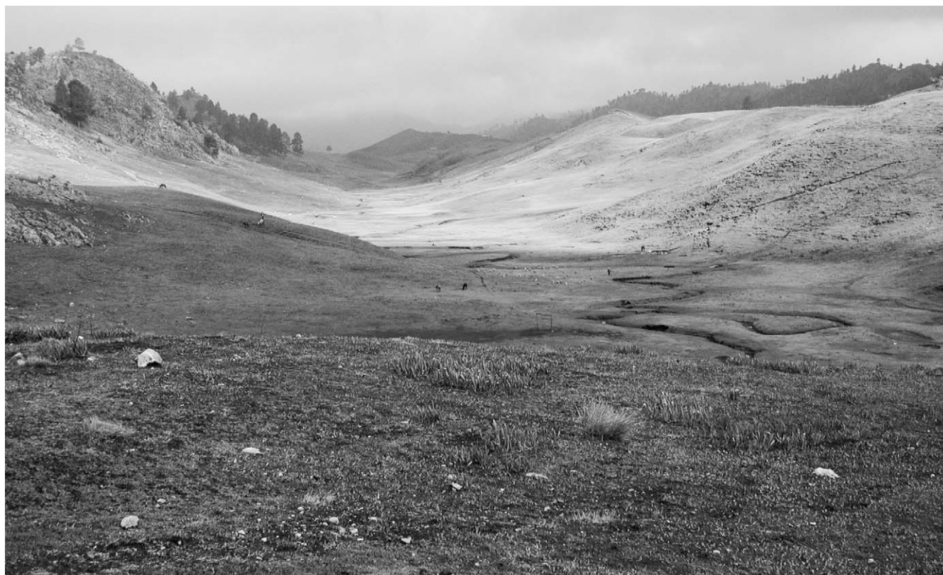
FIGURE 3 Former glaciated valley on the Altos de Chiantla plateau.