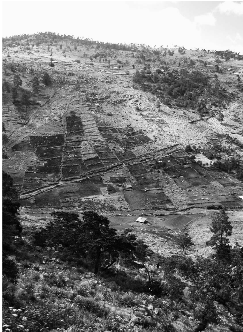
FIGURE 2 Typical landscape in the high Cuchumatanes.