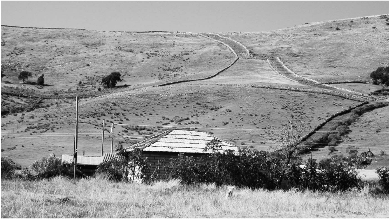
FIGURE 6 Landscape scene showing extensive rock walls, first built in the colonial era.

gone now. Not like when I was a boy. This is very hard on the old people who are poor.” Another stated, “(development) agencies come and go, they waste money and time, why don’t they help people with the trees, with (lack of) firewood?” When asked to rank how important the forest (or lack thereof) issue is, 22 of 24 informants claimed that the scarcity of wood and other forest products was “very important” or “severe.”