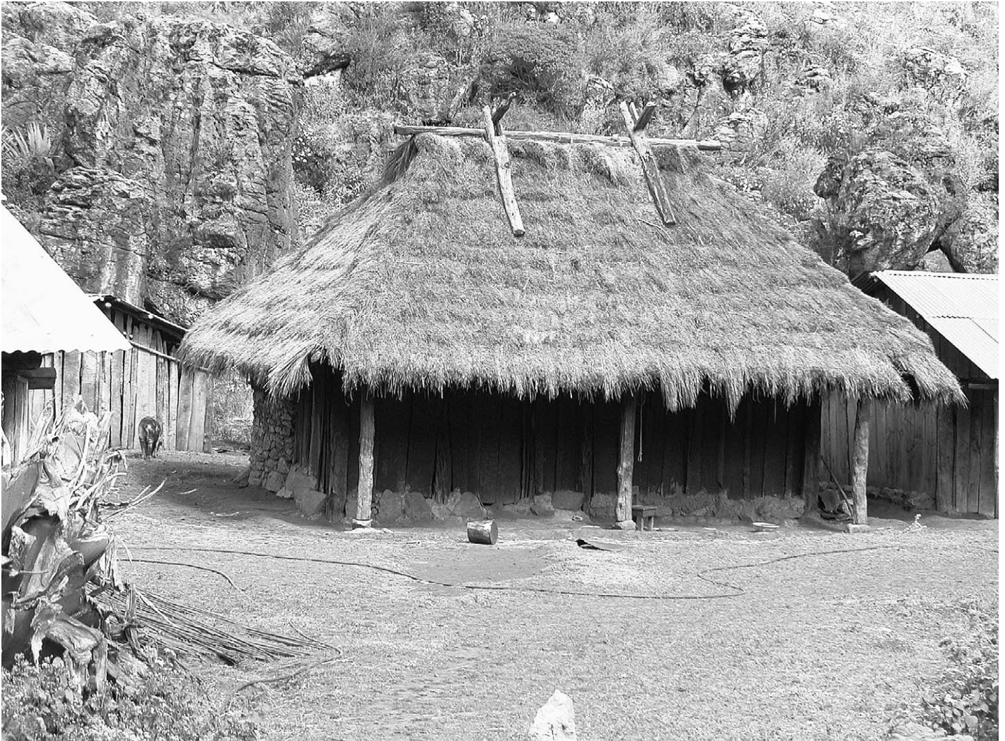
FIGURE 4 Traditional house type in the high Cuchumatanes.

America). Remittances have allowed families to alter the built environment and invest in agricultural modernization efforts. For example, new cinder-block houses have sprung up even in the most remote areas of the plateau. All of our informants claimed that remittances had directly impacted their daily lives, usually allowing them to expand or build homes. Although it is important to point out that while there are financial benefits, many complained that as more people leave, both families and villages suffer. It is stunning to return to a remote area after a two-year absence or so, and instead of finding the traditional Maya house types that once existed, some with wooden shingle or grass roofs (Figure 4), one finds two-storey cinder-block houses with corrugated roofs. One informant joked that replacing the grass roof means that he no longer “lives with the rats.” Many new and old homes alike also have electricity, which arrived in 2002–2003 (Taylor 2005).