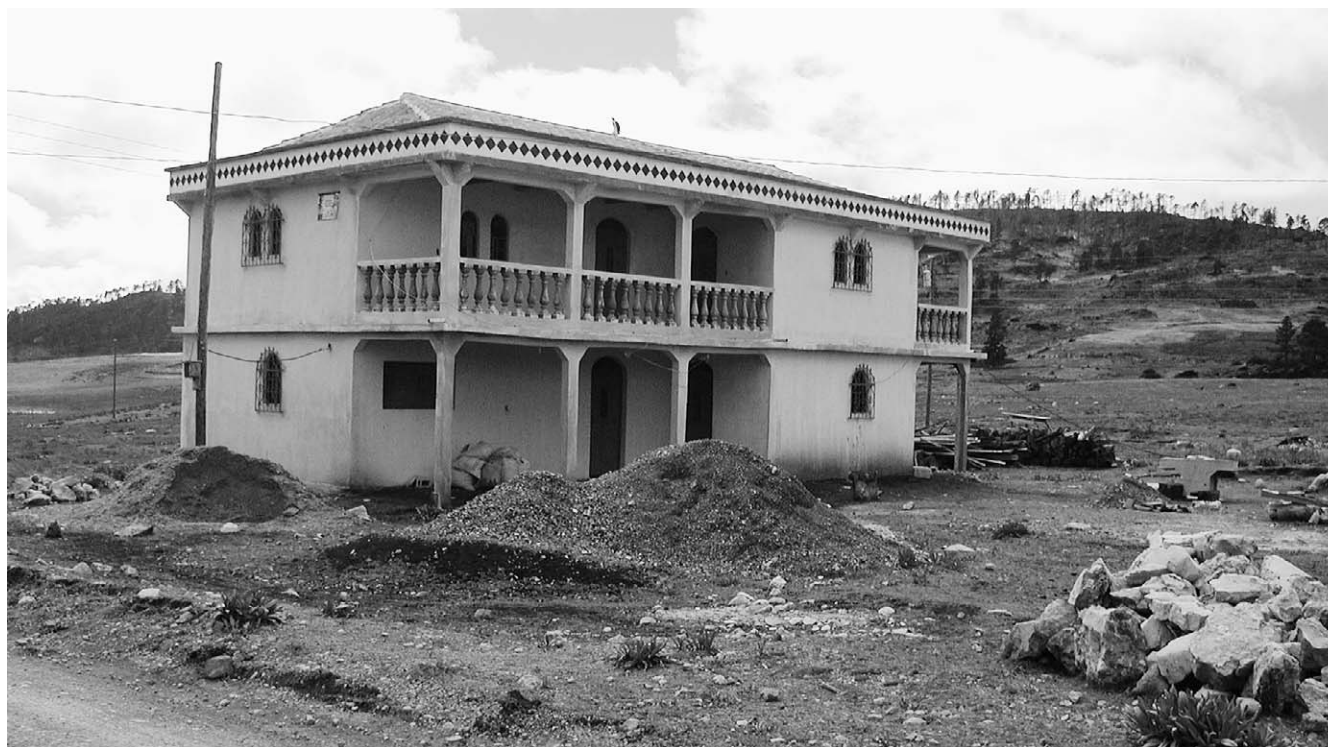
FIGURE 5 New, two-storey house built with remittance money from the USA.

produce the same products that their forefathers did—potatoes and sheep as the dominant products. All our informants were still involved in potato production, and 21 were involved in sheep ranching (at various scales). The harsh environment of the high plateau in the Cuchumatanes simply cannot support other forms of agriculture.