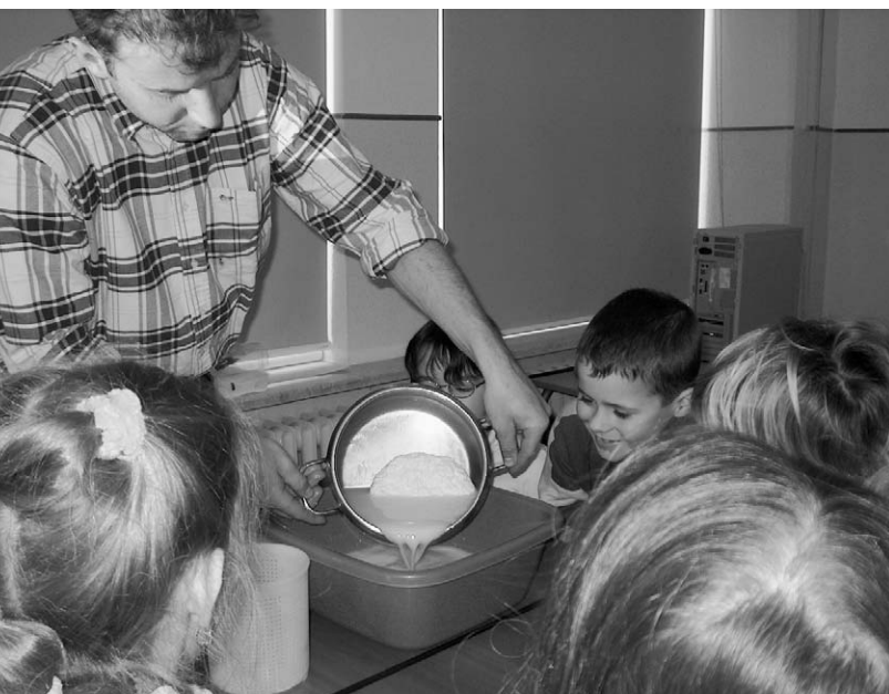
FIGURE 3 On-farm educational activities in Val di Sole, Italy: A farmer shows schoolchildren how cheese is made.

not only at the early stages when the group is defining objectives, but also later in the action implementation phase. There are a number of reasons for this. In the action implementation phase, concrete decision making modifies the problem, requiring new knowledge in that issues are taken into account that were initially ignored. Reformulation may also be related to changes within the local group and its network. Stakeholders from outside often initiate reformulation as they bring in new perspectives, new kinds of knowledge and networks. In Murau, for instance, the cooperative for wood energy changed its objective from selling wood chips to being a major actor of “Energy Vision 2015.” This project launched in the district of Murau in 2001 aims at achieving energy self-sufficiency for the whole district by the year 2015. Reformulation of the problem has gone hand in hand with a scaling-up of the group and a broadening of the partnerships forged at regional level.