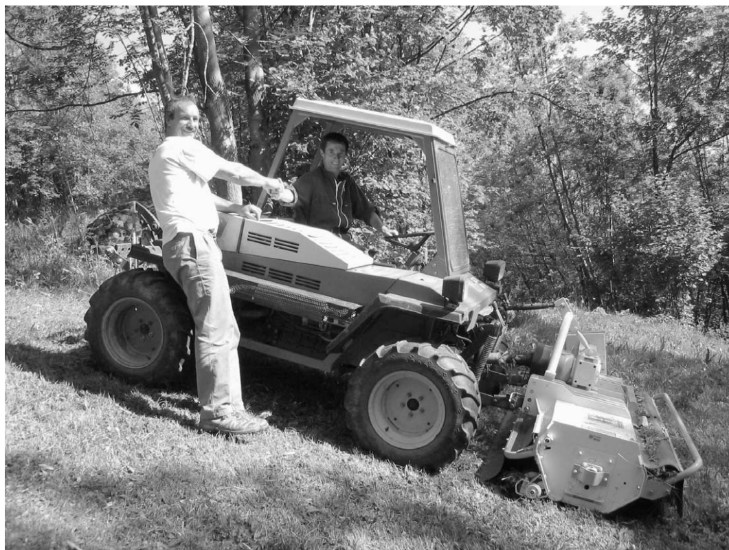
FIGURE 2 A services cooperative of farmers in Moyenne-Tarentaise, France.

identity of actors, the possibilities of interaction, and the margins of maneuver are negotiated and delimited (Callon 1986).