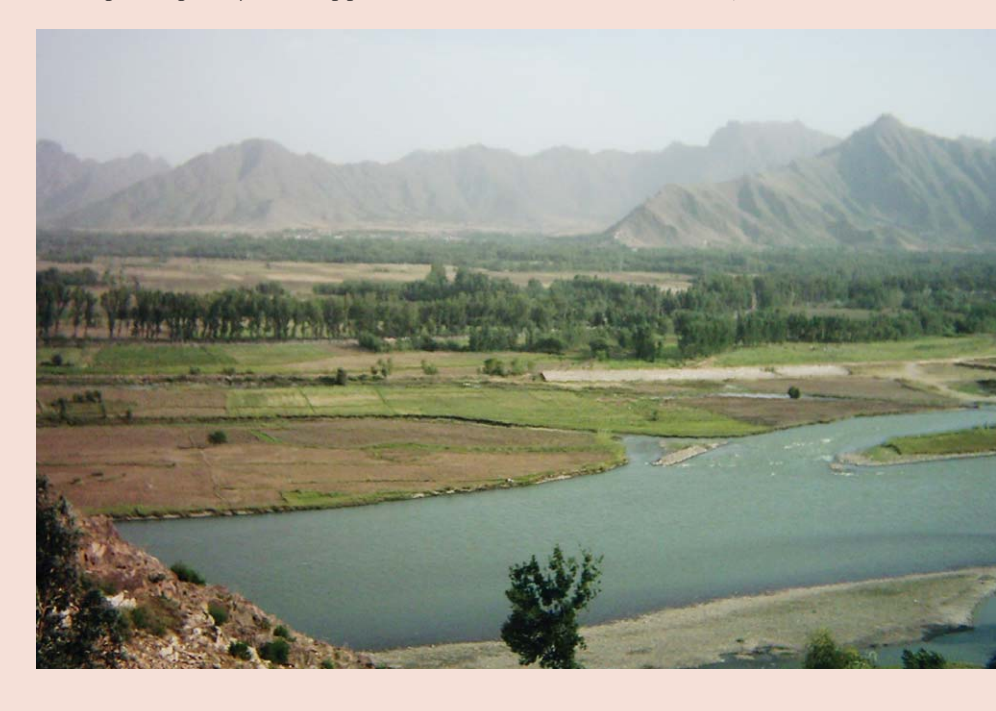
FIGURE 1 The Swat river at Chakdara, looking South: agricultural land in the lower Swat Valley is affected by pesticides. In addition, concentrations of pesticides in the Swat river are increased by input from the upper Swat Valley, where steep slopes are prone to leaching, releasing high concentrations of chemicals.

Soil samples were collected from 12 villages and analyzed for 12 different pesticides using a Gas Chromatograph equipped with an electron captured detector (ECD). In order to know how pesticides are used in Swat Valley and how they affect apiculture, fish, and birds (especially starlings), a comprehensive survey was conducted in 12 villages: 216 farmers were interviewed, corresponding to 10% of the farmer community. The interviews were supplemented by 15 transit walks in 3 seasons (5 walks per season), in addition to other participatory rural appraisal tech-