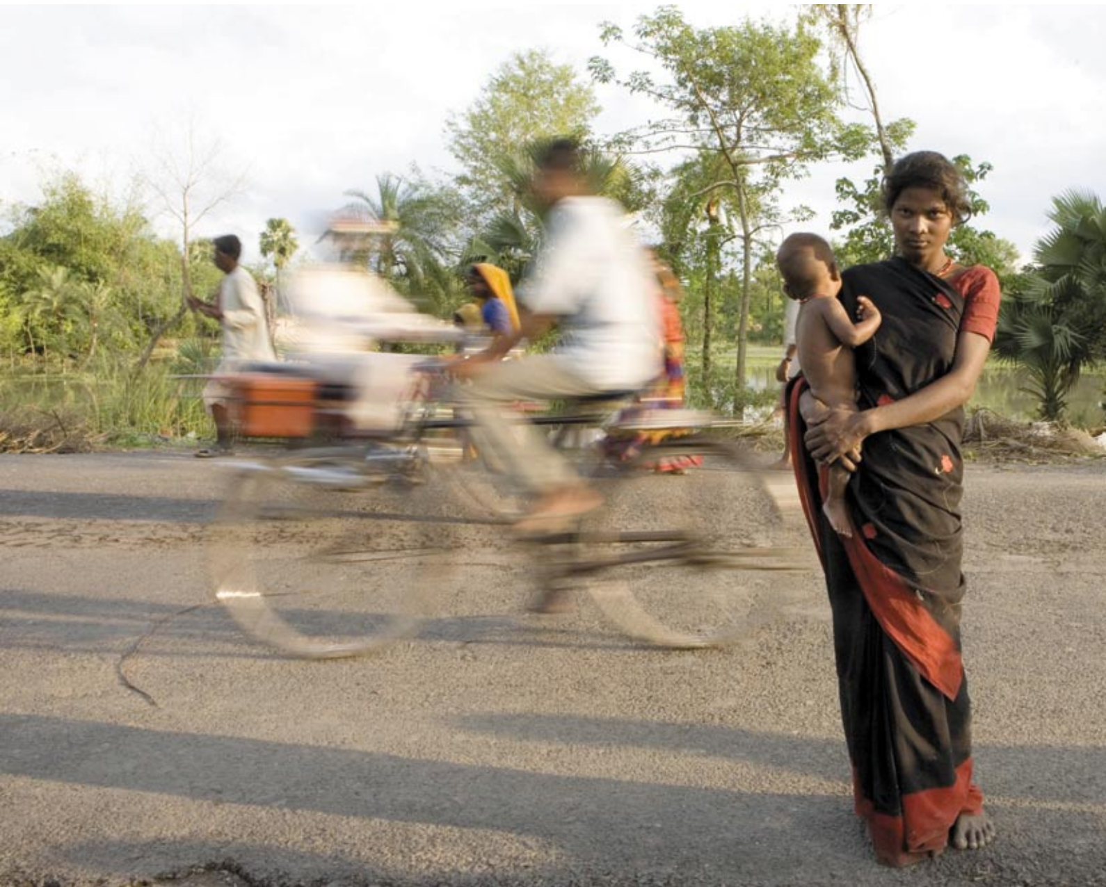
Sanjit Das / ActionAid

their families and communities to overcome poverty. They also highlight their urgent adaptation needs and the support they need from adaptation financing to effectively adapt their livelihoods so that climate shocks do not threaten their very subsistence.