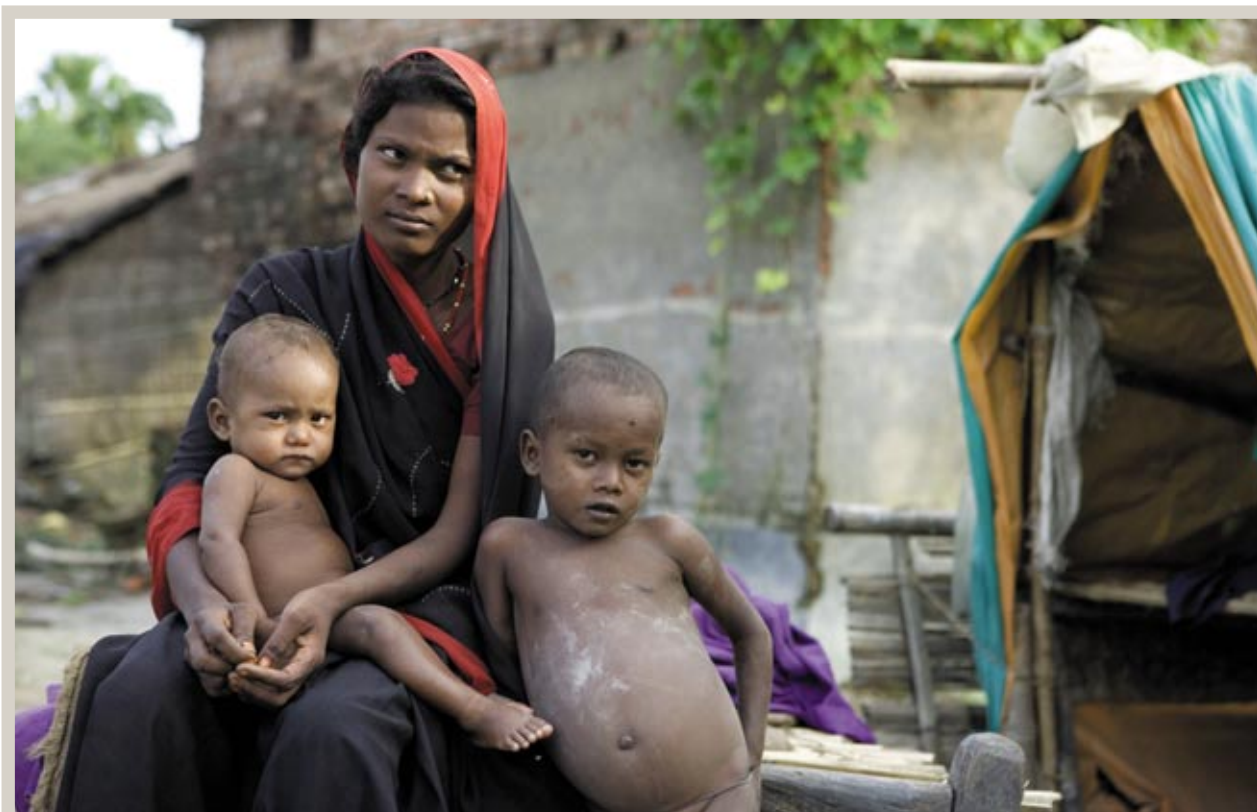
Sanjit Das / ActionAid

The importance of developing women's capacity is supported by other studies. Skutsch notes that, "if women are to be able to tap climate change-related finances at all, it is clear that capacity-building, focused on their needs, will be necessary, including the need to lobby for their own interests within the climate negotiations." 14