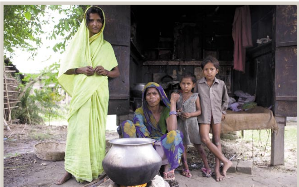
Sanjit Das / ActionAid

Since it is poor women who are disproportionately affected by climate change, there is a strong case for the need to ensure that adaptation funds available through UN mechanisms or other means effectively support women's adaptation to climate change. Climate change interventions that fail to address women's needs will fail to support those most affected by climate change and reinforce the disparity between men and women in their capacity to adapt to it. 7