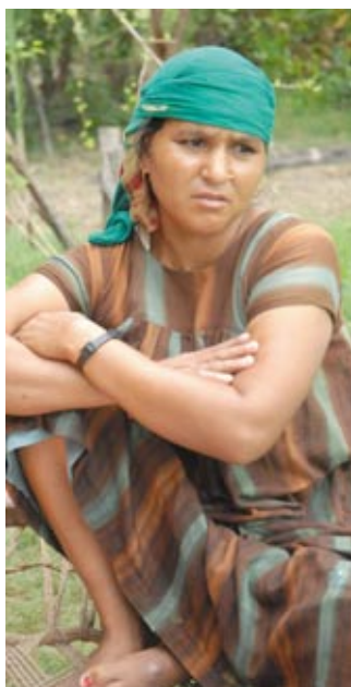
Binod Timilsena / ActionAid