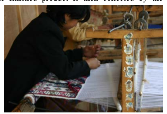
Fig 3: Weaving constitutes a major source of income for park residents

association and sold out by the Tshogpa who serves as the secretary to the association. While the revenue from sale is ploughed back into association fund, weavers are paid for their services to produce the products. One of the finding was also that the association had been able to sell only half of the finished products and that there was a need thus for strengthening the management and marketing skills of the association. The park support to supplying the households with CGI roofing has helped particular, women: in women headed households.