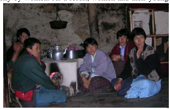
Fig 2: Women spend most of their time in the kitchen; smokeless stoves can contribute greatly to their health

children are exposed to high levels of indoor air pollution. The Biomass Fuel Efficiency Project has installed improved stoves and so consequently improved the condition of the kitchens; reduced time spent on cooking and also reduced smokerelated illnesses. This makes a major difference on women's lives as these areas are their domain. The members of the group all received technical training to install the stoves. This is in itself a way of empowering women as it is a form of education.