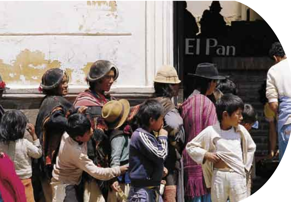
Bolivian citizens queuing up for bread.