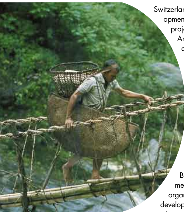
Food, medicine, construction material and information cross a bridge – often a village's only open door to the outside world.

Both Nepal and Switzerland are resource-poor countries, endowed with few raw materials and limited agricultural resources. From a historical point of view, the road to food security is long and paved with numerous social obstacles as well as ecological and economic risks. Nepal is encountering the same kinds of problems Switzerland encountered in the past. Food security is never definitively attained: it is constantly put to the test by new circumstances.