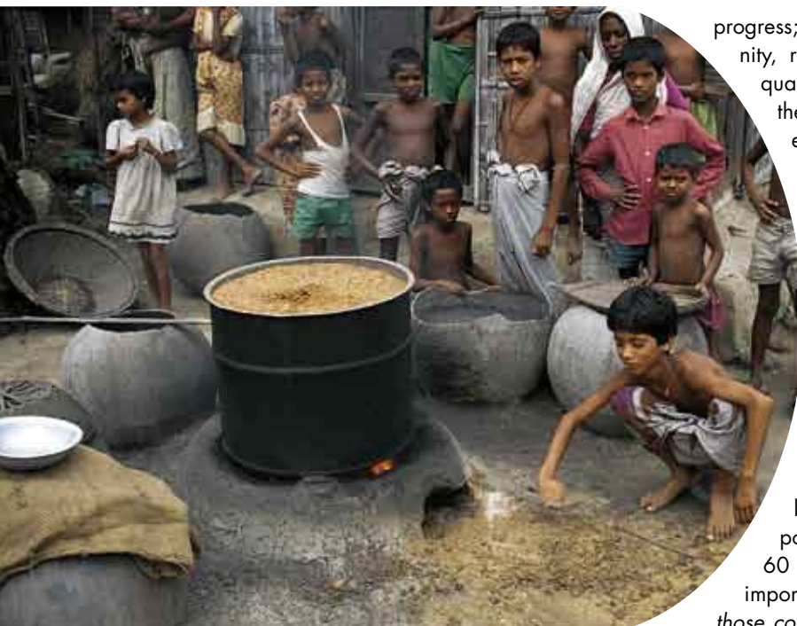
Processing of a harvested crop: rice is cooked to make husking easier. Bangladesh.

progress; often too low for them to live on their work with dignity, renew their means of production (including buying quality seeds for the next sowing season) and maintain their market share; and too low for them to even properly feed themselves. Indeed, half of the world's farmers – i.e. those who are the least equipped, least adapted and have the least access to suitable land – do not have enough to eat. The survival of a rural household whose income falls below the level of renewal is only possible at the price of converting capital goods to cash (i.e. by selling livestock, reducing or not maintaining farm implements, etc.), under-consumption (farmers in rags, unkempt children who do not attend school, etc.) and finally undernourishment. If sending the younger generation to work in town does not ensure the survival of rural families, farm abandonment and exodus usually follow. In certain cases, illegal crops such as coca, poppy and hemp are the last resort. Thus, in the past 60 years, over 80 poor countries have become major importers of staple foods (wheat, rice, maize, etc.). "In those countries where agriculture is still the dominant source of food and livelihoods, dumped imports undermine food security.