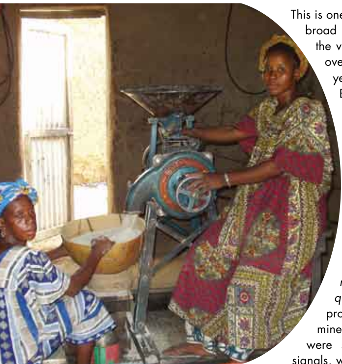
A women's group runs the village cereal mill.

Food security has not yet been attained in Burkina Faso. The country remains one of the poorest on the planet and currently imports US$ 78 million worth of cereals each year, amounting to a total of approximately 250,000 tonnes of rice, wheat and maize. However, the government and international funding institutions are focusing exclusively on cotton and its price on the international market; cotton is the only product for which the state has a national policy and instruments to support production. While cotton is the main source of state revenue, sales of food products account for 80% of farmers' income.