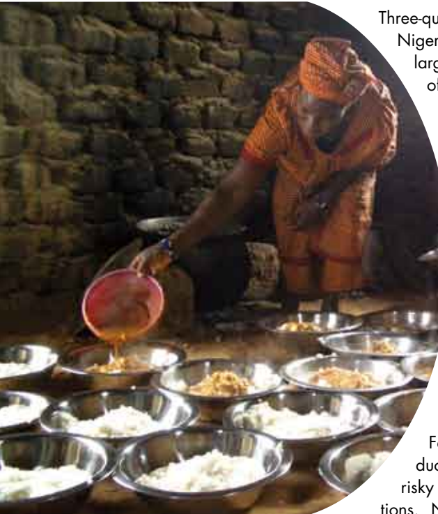
Niger: distribution of a meal in a school.

In particularly bad years Niger is rapidly confronted with an acute food crisis, as was the case in 2004. During that critical year, crops were doubly affected – first by prolonged drought and then by a cricket invasion – leading to a famine that threatened a large part of the country's population.