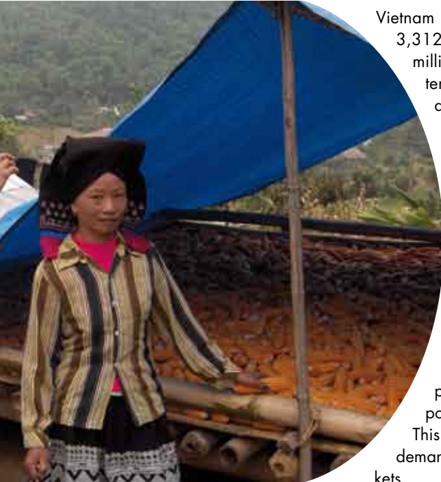
Proper post-harvest storage is indispensable for obtaining a quality product. Drying of corn ears before they are processed for flour. Cao Son village, Vietnam.

Market incentives are motivating producers, traders, carriers, and service and processing enterprises to organise effective value chains. Besides generating profit for producers and intermediaries, these value chains also ensure sufficient supplies for urban consumers in terms of both quantity and quality.