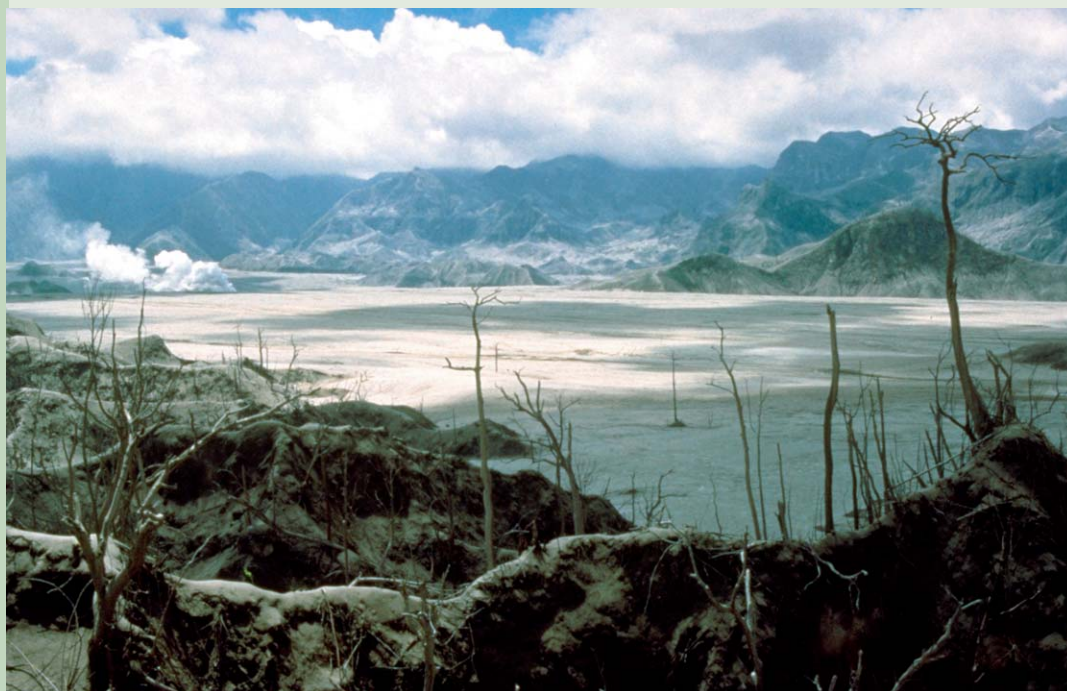
FIGURE 1 View to the northeast across pyroclastic-flow deposits and a fumarole in the Marella River valley toward Mt Pinatubo. The vegetation in the foreground has been stripped and charred by ash-cloud surges of pyroclastic flows.

of the eruption on 15 June that affected even the town inhabitants, the authorities once again had to transfer many Aeta families to evacuation centers much farther from their villages. Inside overcrowded school buildings, gymnasiums, churches, and tent camps, nutrition problems and diseases (pneumonia, measles) spread quickly, taking a heavy death toll among Aeta children. Faced with the impossibility of sending the Aetas back to their former villages, which had been buried under meters of volcanic deposits, the Philippine government eventually had to plan a permanent resettlement program. By June 1991, the authorities had created eleven upland resettlement centers intended primarily for the Aetas. In these centers, each family was allocated a lot measuring 150 m 2 and traditional