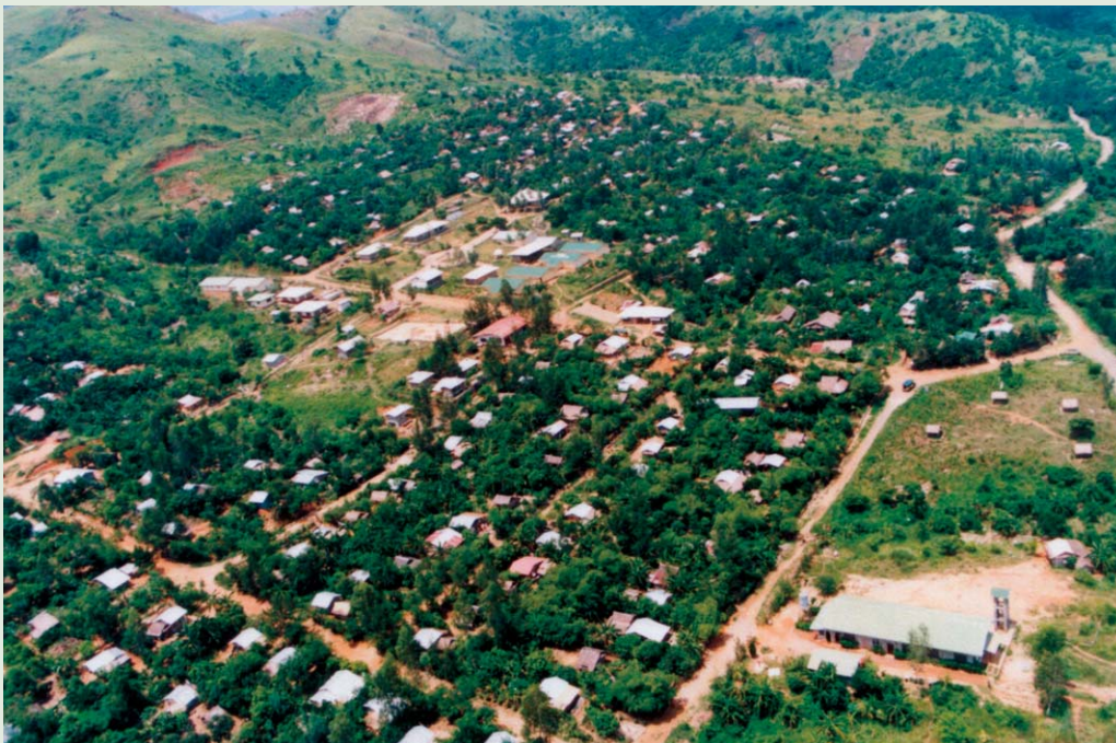
FIGURE 3 The Cawag resettlement center, where Aetas who were victims of the 1991 Mt Pinatubo eruption found refuge. (Photo courtesy of the Mount Pinatubo Commission, mid-1990s)

Changes have concerned components of the Aeta social fabric exposed to these interactions. Table 1 shows that these changes include settlement patterns, religion, language, medicinal treatments, clothing, diet, land tenure, and farming activities. On the other hand, some of the fundamentals pertaining to relationships within the society, notably a “communal” sense (eg groups of 2 to 3 Aeta households still co-exploit swiddens, share food, and journey together to the public markets for economic transactions) and kinship patterns (eg traditional weddings still involve a 3-stage procedure which includes the formal proposal, the very important negotiation of bridewealth, and