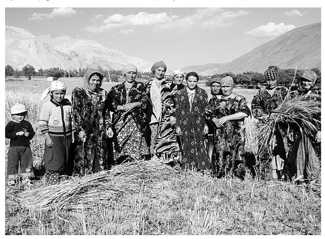
FIGURE 3 If empowered and informed, Muslim women in Tajikistan as well as elsewhere in mountainous Central Asia can play a key role in helping to redress the erosion of seismic culture.

that the Kashmir Earthquake occurred because, as many put it, "it was God's will" and "God's will and destiny chooses who survives and what places get destroyed." There was also a disturbing campaign alleging that one of the reasons for the Kashmir Earthquake was women's sins, inappropriate behavior, and dress. The lack of sound information can lead to blaming these types of events on metaphysical phenomena or social groups rather than focusing attention on the physical hazard, preparedness, and planning. When asked from where they received information regarding relief and reconstruction, the majority of respondents indicated that they had no place to go to collect such information. Nevertheless, tremendous concern exists with regard to the safety of structures and communities in the future. One 30-year-old male teacher in a local school put it this way, "this area is not safe. People are tense and tremors make people worry. Areas should be planned to be safer."