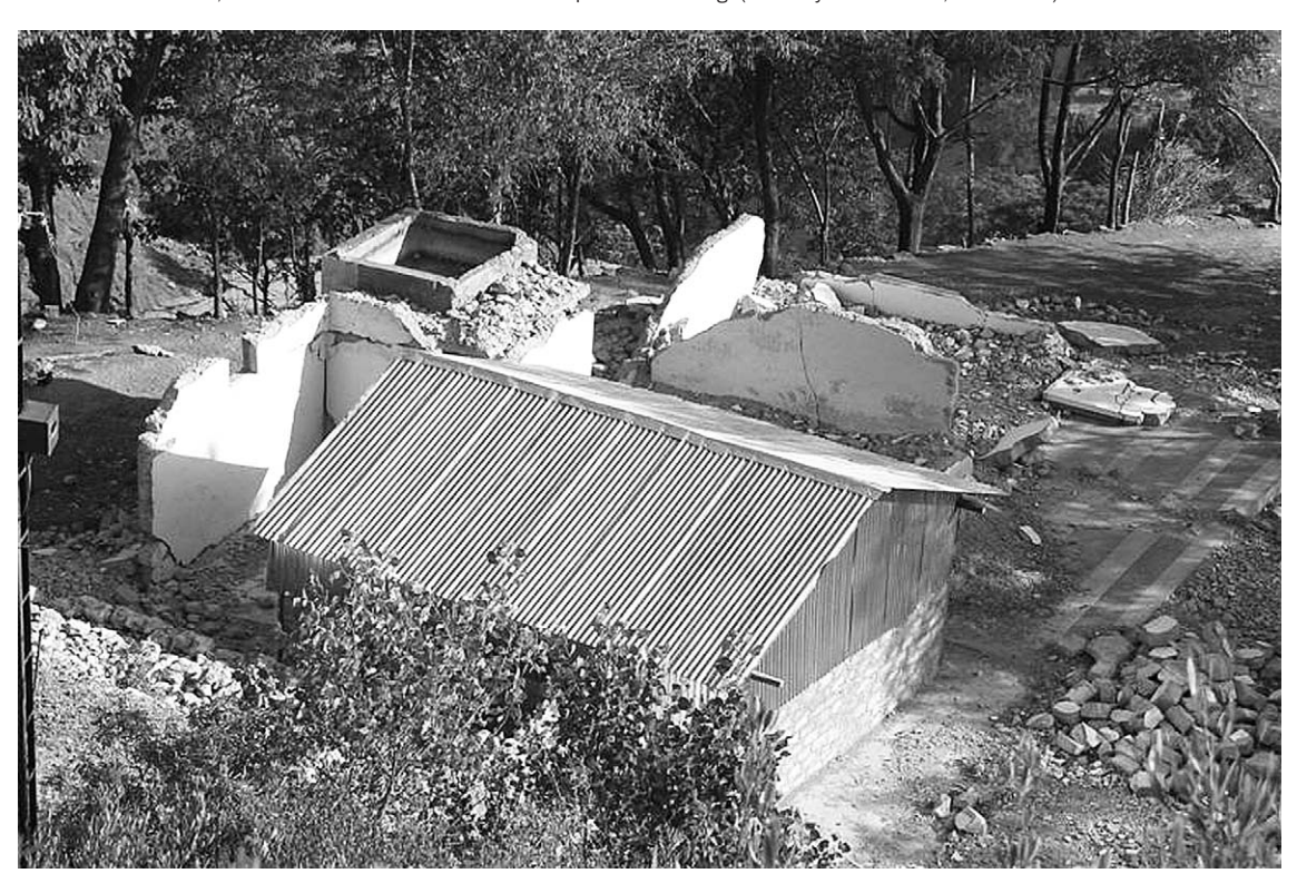
FIGURE 2 The government recommended-rebuilding scheme incorporates the use of a wood frame with 90–120 centimeters of brick or concrete on the lower walls and corrugated galvanized iron (CGI) sheets for upper walls and roofs. Among those interviewed in Pakistani administered Kashmir, 80% felt that this was the best technique for rebuilding.

maintenance, and transmission of seismic culture. Our research suggests that hazard-related information is typically held and shared by elders and passed on orally to younger generations. One Kashmir Earthquake survivor commented, "children didn't previously, but now they ask why the earthquake happened so we [the teachers] talk about it." Yet, the trends in migration, human movement, and social change (Olimova and Olimov 2007) imply the uprooting and relocation of younger segments of the population with an overall erosive effect on cultural adaptations to seismic exposure.