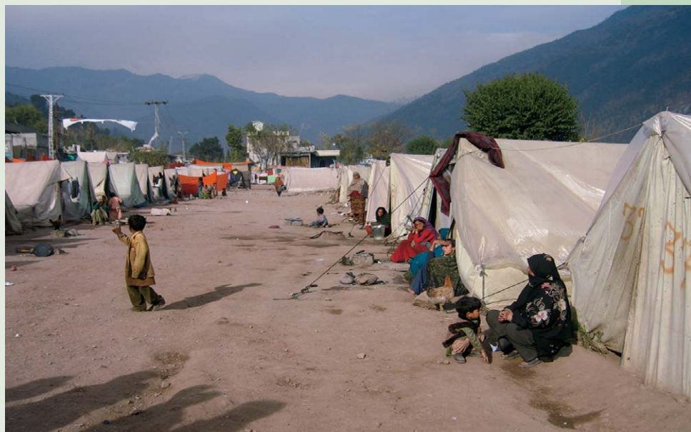
FIGURE 2 An emergency tent village on the outskirts of Balakot provides little privacy and personal space for women.

The reality of families and villages being partially or completely buried by rubble and landslide debris overwhelmed the physical and psychological capacity of traditional social-support systems. The surviving women and their families experienced dramatic reductions in food, fuel,