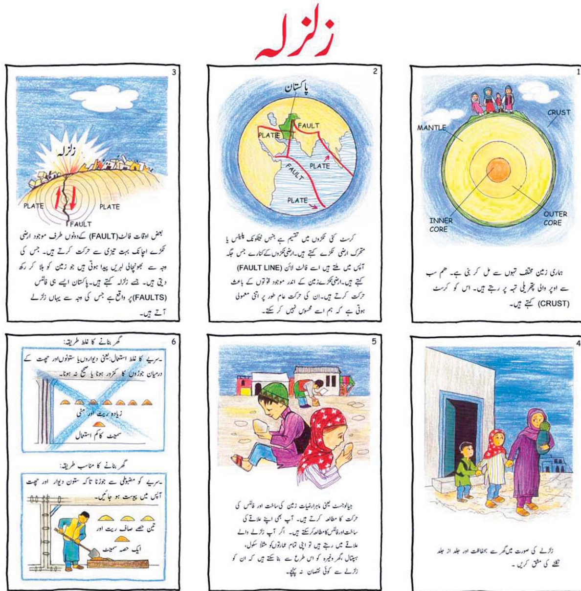
FIGURE 5 The physical processes that cause earthquakes and the actions that will keep household members safe are the topics of this educational poster distributed in Urdu.

The socioeconomic and cultural context of vulnerability and gender-based needs in pre-disaster settings should be evaluated and incorporated into disaster preparedness plans.