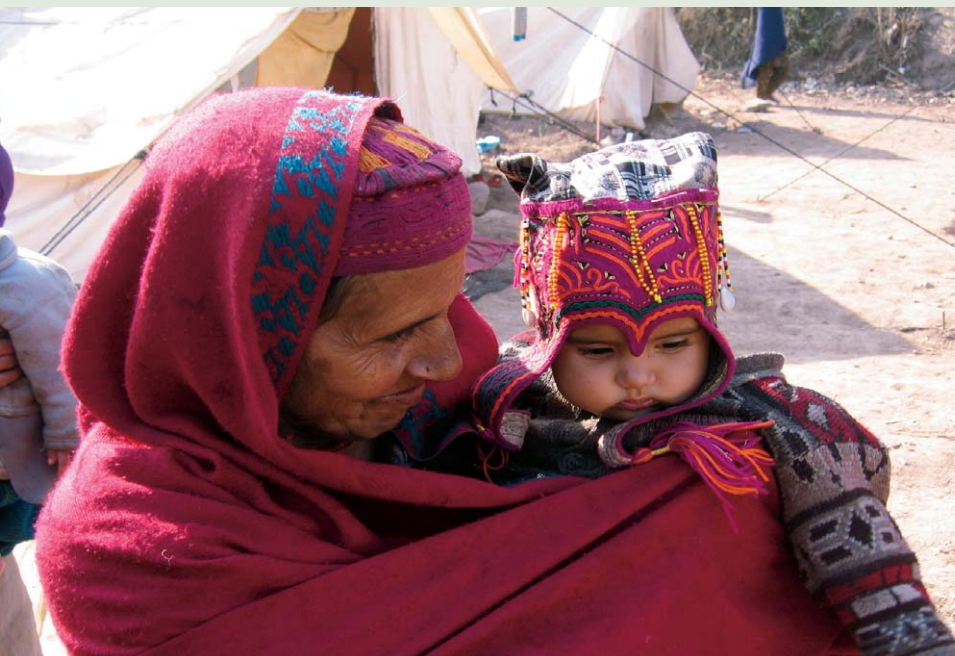
FIGURE 3 Women in tent camps, such as the elderly woman pictured here, took on the roles of surrogate mothers and childcare providers for mothers who had been injured or died as a result of the earthquake. (Photo by J.P. Hamilton, June 2006)

first responders caring for the injured and the dying (Figure 3).