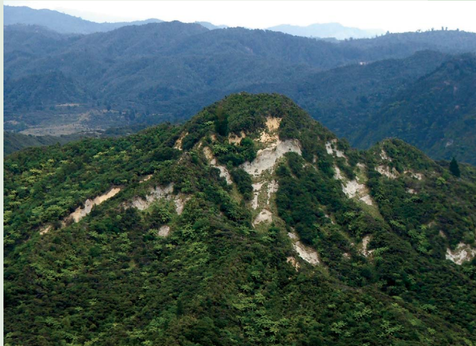
FIGURE 2 Hill-country erosion is a serious problem in the East Cape region, but reforestation can improve soil stability.

Māori landowners. At the outset, part of the project funding was allocated to purchase credits from the farmers for the first Kyoto commitment period at a uniform price of NZ$15 (US$ 11.25) per ton of CO 2 e.