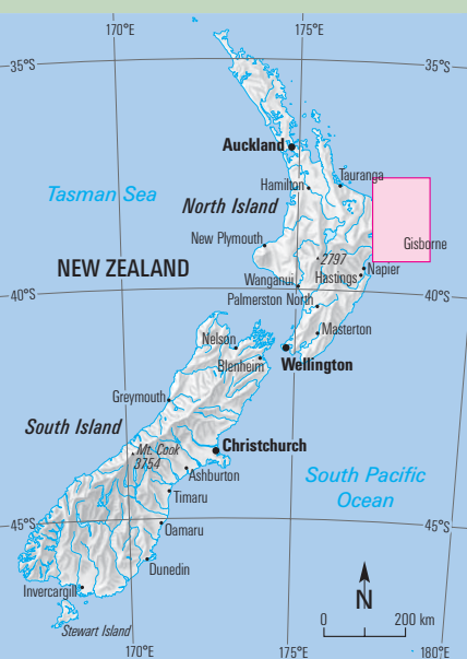
FIGURE 1 Map of the East Cape of NZ. (Map by Andreas Brodbeck)

worked with indigenous Māori landowners in a rural area of NZ to implement a “carbon farming” project—a management system that encourages reforestation and generates marketable offsets for greenhouse gas emissions under the Kyoto Protocol. Our experience in establishing a carbon sequestration project sheds light on the factors affecting uptake and project success for other groups seeking to utilize these markets as a tool for sustainable development.