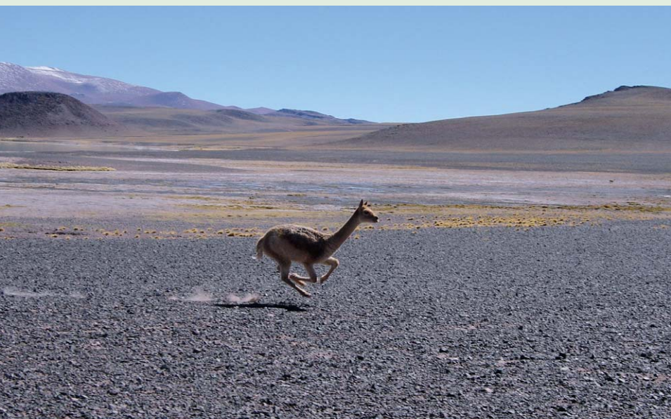
FIGURE 3 Vicuñas in the Argentinean Andes. Once an endangered species, the vicuña has seen its population increase rapidly during the last decades, coinciding with a decrease in rural population.

decrease in hunting and competition with domestic grazers is probably a more important factor (Figure 3).