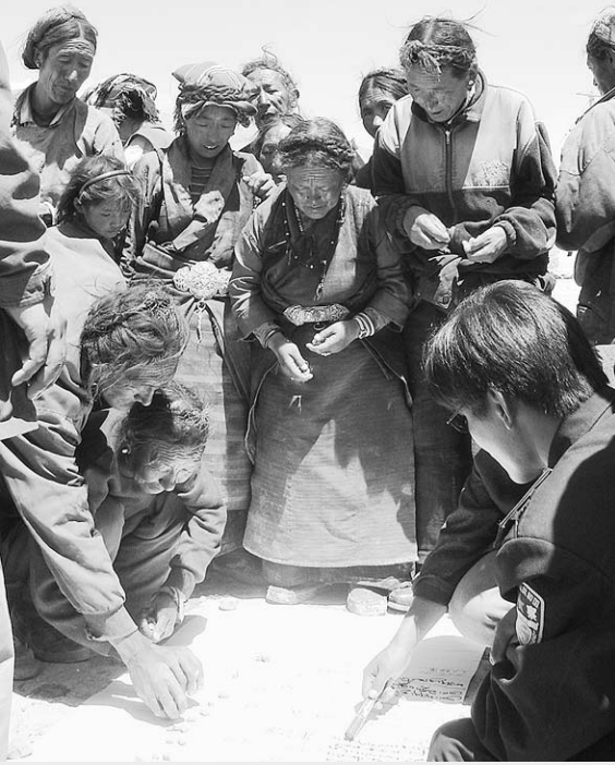
FIGURE 2 Promoting equitable co-management of rangeland resources through RRP initiatives.

rangeland for multiple purposes, but focusing on a commonly agreed goal. The core of the co-management approach is negotiation and the essence is ‘learning by doing.’ Co-management of rangeland is taking place at all RRP pilot sites at various administrative levels. The RRP is also facilitating institutional arrangements in all its pilot project countries by applying a co-management approach, using both formal and informal mechanisms.