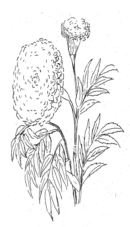
Figure 2: Marigold