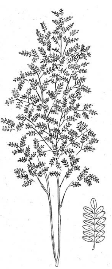
Figure 1: Indigo

Today, dyeing is a complex, specialised science. Nearly all dyestuffs are now produced from synthetic compounds. This means that costs have been greatly reduced and certain application and wear characteristics have been greatly enhanced. But many practitioners of the craft of natural dying (i.e. using naturally occurring sources of dye) maintain that natural dyes have a far superior aesthetic quality which is much more pleasing to the eye. On the other hand, many commercial practitioners feel that natural dyes are non-viable on grounds of both quality and economics. In the West, natural dyeing is now practised only as a handcraft, synthetic dyes being used in all commercial applications. Some craft spinners, weavers, and knitters use natural dyes as a particular feature of their work.