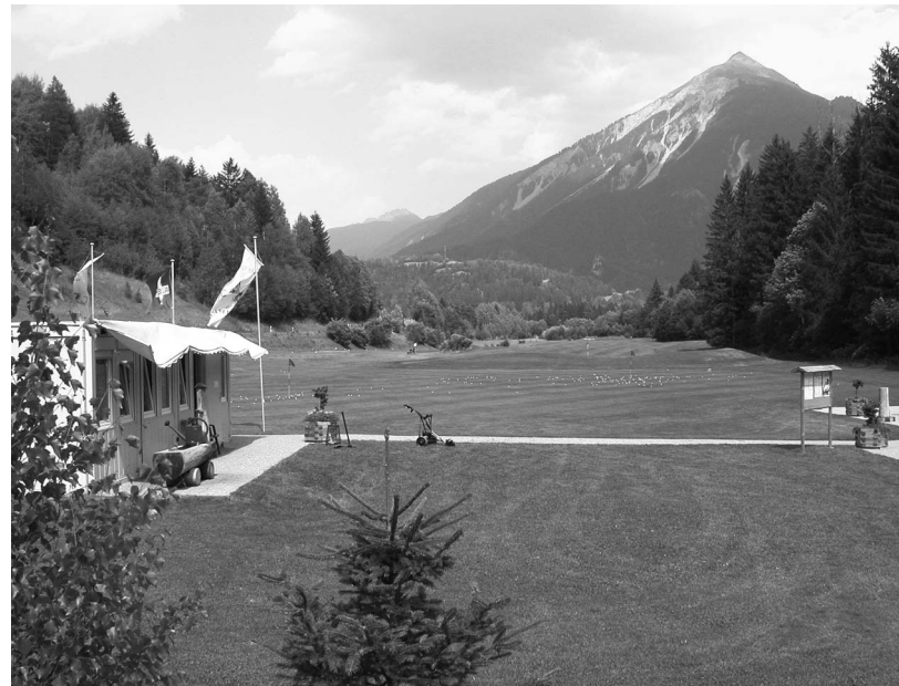
FIGURE 5 Eighteen-hole golf course in Alvaneu Bad.

pole. Some informants nevertheless described how some places became meaningful for them due to personal leisure activities. In their case, the key category remembered leisure activities lies close to the individual pole.