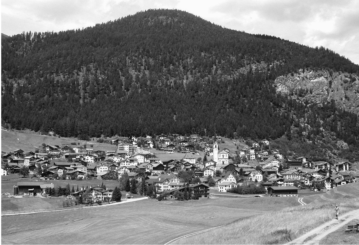
FIGURE 1 The village of Alvaneu, Canton of Grisons, Switzerland.

These studies elucidate that for tourists, visited places can be as deeply meaningful as for locals, notably as symbols of important experiences or because of the places' restorative value. But empirical studies focus mostly on defining the constituents of sense of place, or on the strength of place relations. Stedman's (2003) quantitative study in northern Wisconsin demonstrates that sense of place is not just based on social constructions, but also on some material reality, ie on concrete landscape characteristics. Hay (1998) found in a survey study on Banks Peninsula, New Zealand, that the sense of place of local Maori people is deeply rooted, whereas the sense of place of tourists is rather superficial, due to different residential status and thus different ancestral and cultural connections. Still, no studies have examined the contents and conditions of sense of place, particularly with regard to group differences. Empirical knowledge of differences in sense of place between the 2 main interest groups with respect to Alpine landscape development, locals and tourists, is especially poor.