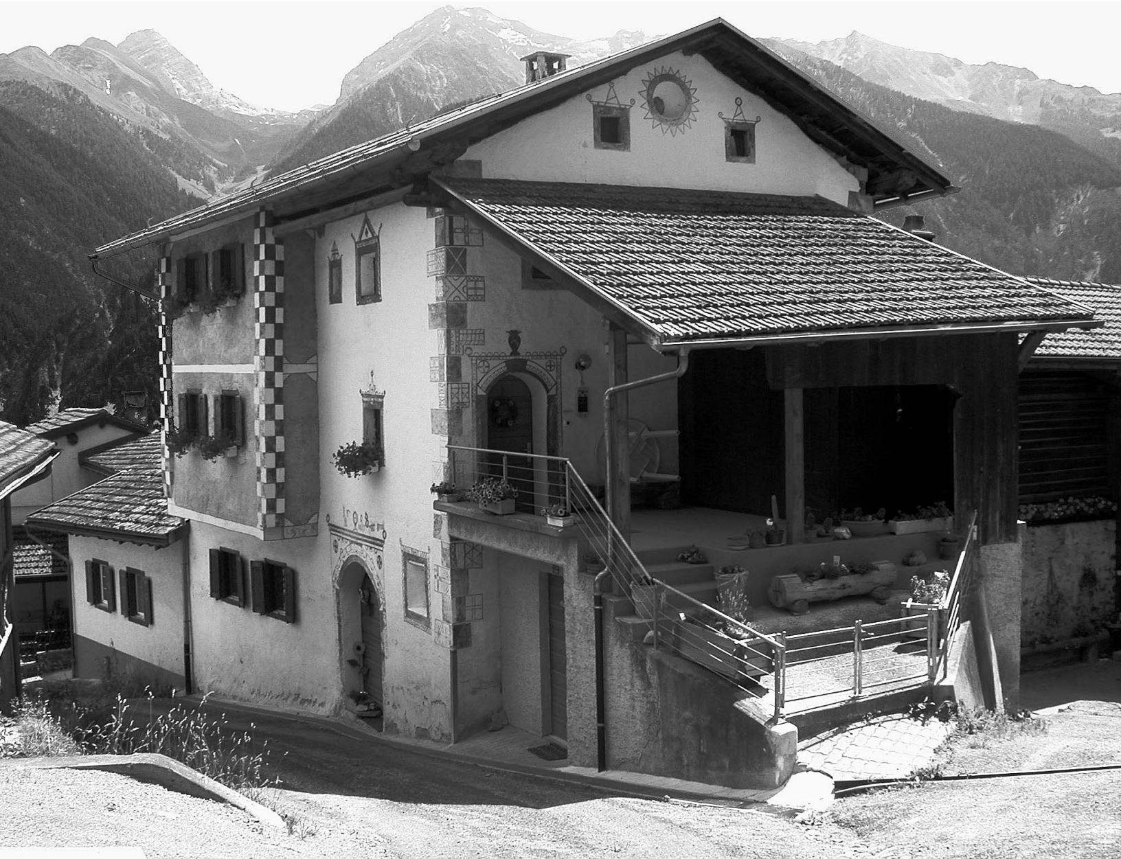
60 FIGURE 4 Construction in a traditional style, typical of Alvaneu.

friends and their common experiences of place. Furthermore, tourists seemed to be particularly satisfied if they got to know local people and especially proud if they established friendly relationships with them. Therefore, the key category personal relationships likewise encompasses individual and social aspects.