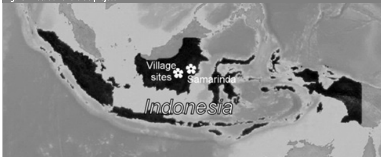
Figure 1: Location of the CIS project

This article examines alternatives to typical GIS. Using the example of a participatory action research project in Indonesia that we were involved in, we consider how to support indigenous communities in expressing, documenting, visualising and communicating their traditional and contemporary land related knowledge using geographic ICTs. The technologies used were selected on the basis of their appropriateness for recording and communicating land-related traditional knowledge, as well as their simplicity and low cost. The final product was called a Community Information System (CIS).