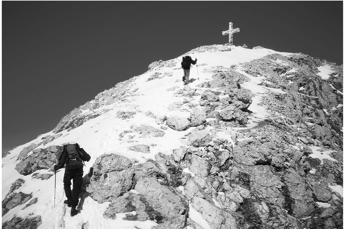
FIGURE 2 Final ascent to the summit of the Plattkofel (2955 m) in the Italian Dolomites: an example of the goals that Catholic Alpinism tried to encourage.

could be considered “a branch of ascetic theology, while the ascension was a pilgrimage to the Mount of the Lord.” It was not “something for daredevils; on the contrary, it was all a question of caution, a bit of courage, strength and perseverance, a feeling for nature and its more hidden beauties,” stated Achille Ratti, the alpinist Pope Pius XI, who saw mountains as the ideal place to experience religion (Bobbà and Mauro 1923).