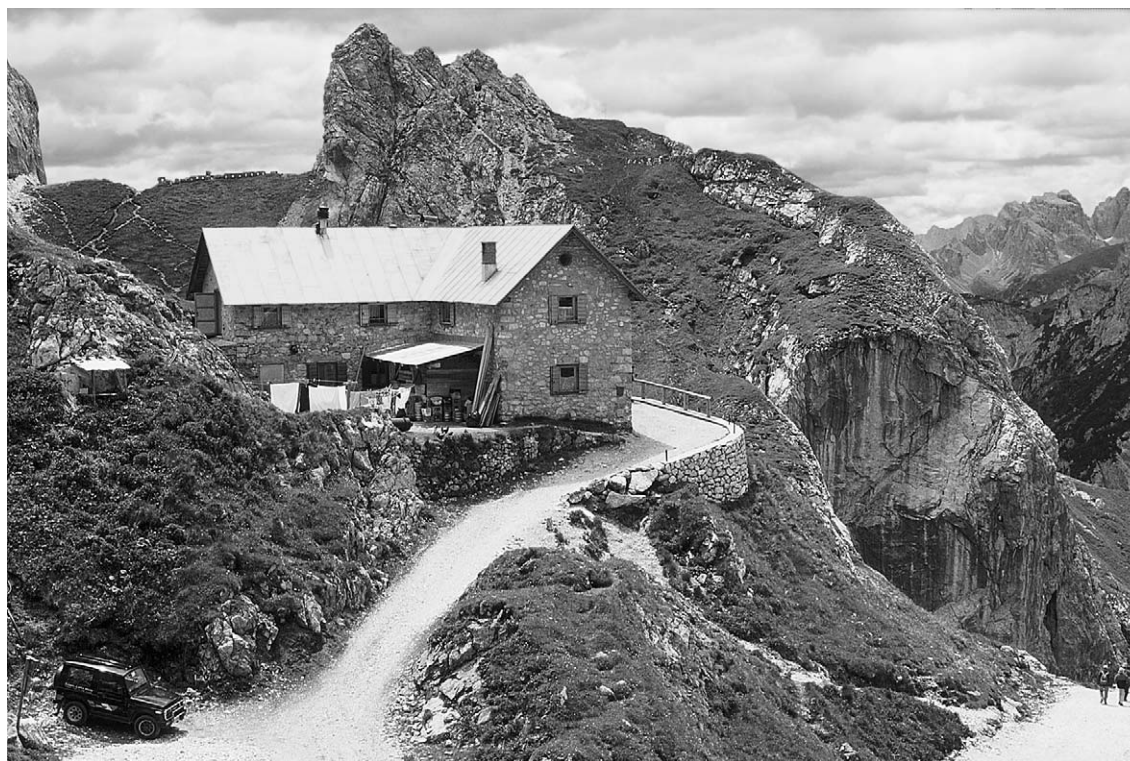
FIGURE 1 The rifugio Calvi in the Karnisch Alps, northern Italy—an example of the kind of accommodation typical of a later stage of alpinism in Europe. Pope Paul VI once visited this mountain hostel, testifying to the importance of such places for Catholic Alpinism.

ple and channel their aggressiveness within socially acceptable boundaries. Taking the young to the mountains became an important habit for the Christian apostolate between the 19th and 20th centuries. It was a way to deter the young from temptations and vice, and to sublimate their sexual activity and violent impulses into an itinerary of virtue. It was also a way to spend spare time and keep the young away from idleness, alcohol, taverns, and the dangers of the street.