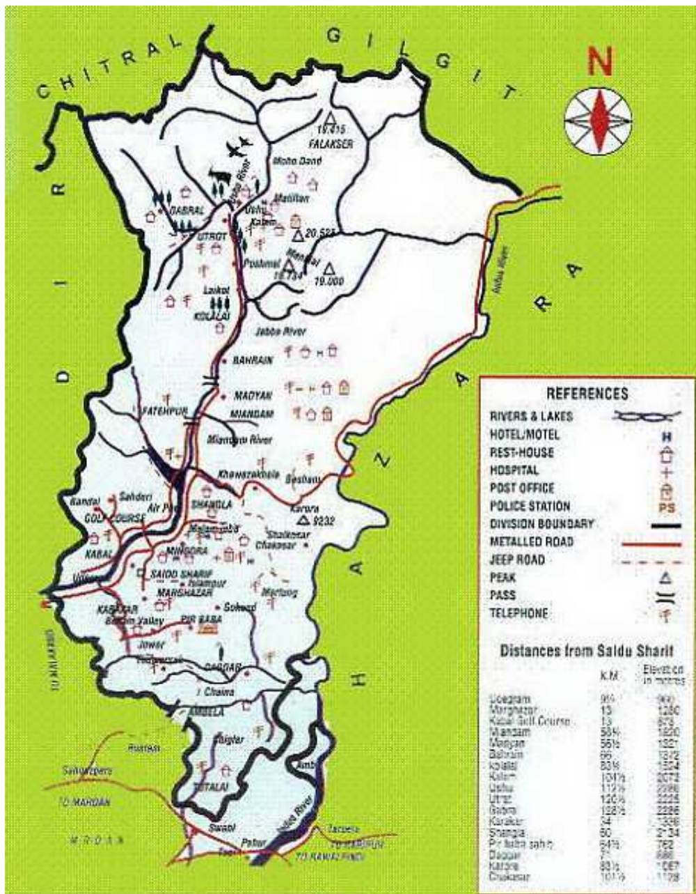
Figure 1: Map of District Swat

Swat can be divided into two regions i.e., Swat-Kohistan and Swat Proper. Swat-Kohistan is the mountainous country on the upper reaches of the Swat river up to Ain in the south. The whole area south of Ain is Swat proper, which can be further divided into: