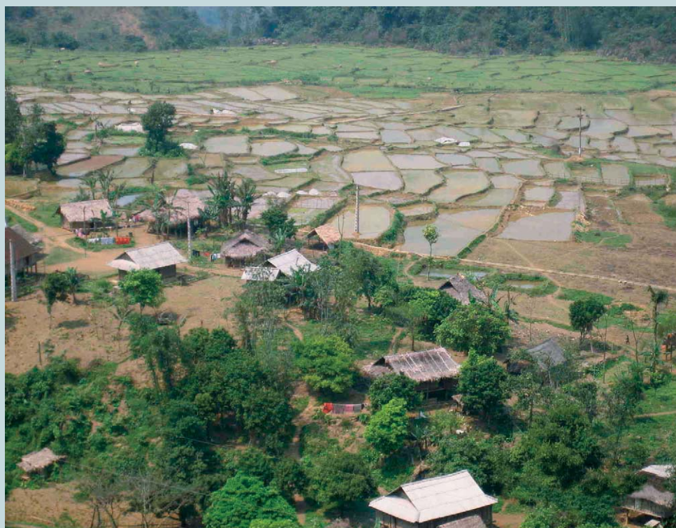
FIGURE 1 Rice paddy cultivation on the floor of the valley, Hoa Binh Province.

Our data suggest that there is a disconnection between official policies and local understanding of the appropriate implementation of land use policies. For example, district officials in Tuong Duong district have allocated land differently from the methods deemed appropriate by the central government. People at the commune and hamlet levels often report that land allocation is incomplete; moreover, farmers are often unaware or have an incomplete understanding of policies implemented at the provincial and district levels. In one commune in Tuong Duong district, for instance, the commune officers report that 4 of 5 hamlets had land allocated in 1998/1999. One hamlet refused to allow the land allocation at that time; instead, land was allocated in 2001/2002, at which time a different allocation system was used by the district officials. Here we should understand the problem that local authorities face due to the many land policies and laws that have been issued over time (1993,