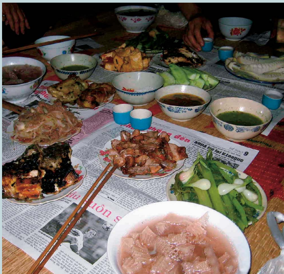
FIGURE 3 Thai meal to welcome visitors to a house in Son La Province: an example of food security increased by CSA.

Swiddening is not the main cause of poverty or environmental degradation in upland Vietnam; rather, it is often a rational way of keeping poverty at bay under difficult circumstances. For a variety of reasons, swidden farmers are generally poor and belong to the most vulnerable groups in Vietnamese society. Changing farming