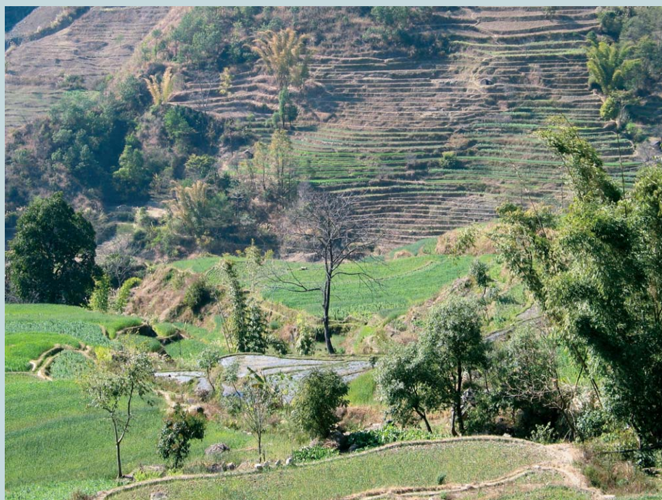
FIGURE 2 On-farm agroforestry and intercropping trials.

This environmental training program has not been limited to government bureaus. In order to foster ongoing community support and understanding, we have worked with local partners to establish community environmental education programs targeted at elementary and secondary schools, as well as training for teachers in environmental education. Village workshops and information exchanges were held regularly, and students and their families attended training sessions at local