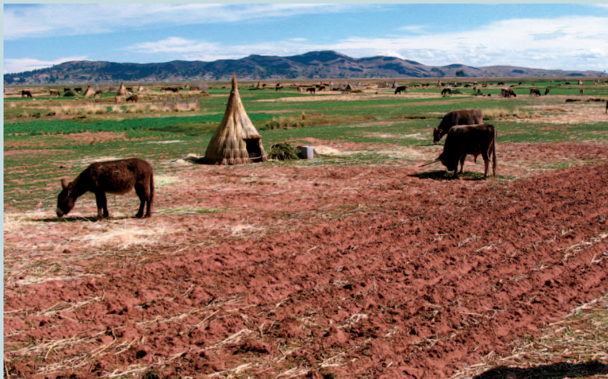
FIGURE 1 The centuries-old land use system developed by the indigenous communities on the Altiplano combines crop and livestock production.

During the last two decades, the International Potato Center (CIP) and its part-