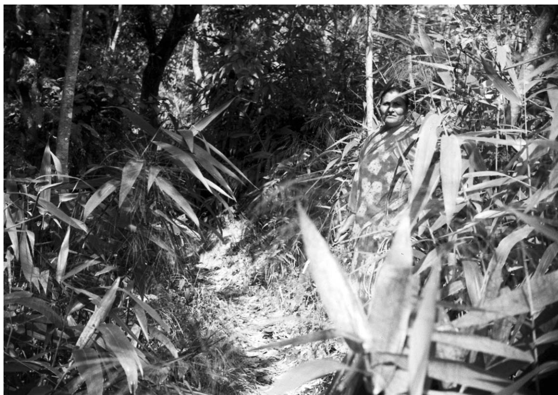
FIGURE 2 The Malati forest has multiple functions, thanks to its under-canopy layer where grass grows abundantly. The trail that runs in front of this woman's feet separates two plots.

forest products reach the depot, they are ready for selling. Users, based on their requirements and purchase capacity, buy the forest products.