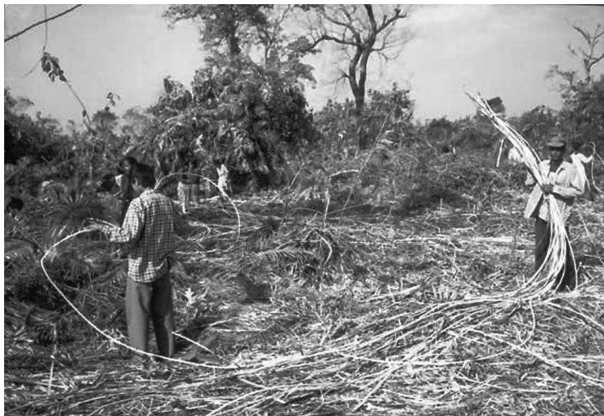
Figure 3. Community people busy with rattan harvesting.

Even after the forest was handed over to the community, they continued the previous system for the first few years until a training course on rattan management took place in 1997. With the support of experts, the community prepared a rattan management plan and divided the rattan forest into six blocks for 5 years rotational harvesting. One of the blocks was maintained for research and conservation purposes.