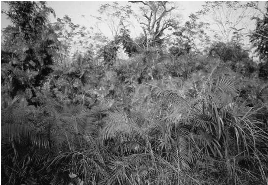
Figure 2. Community rattan forest.