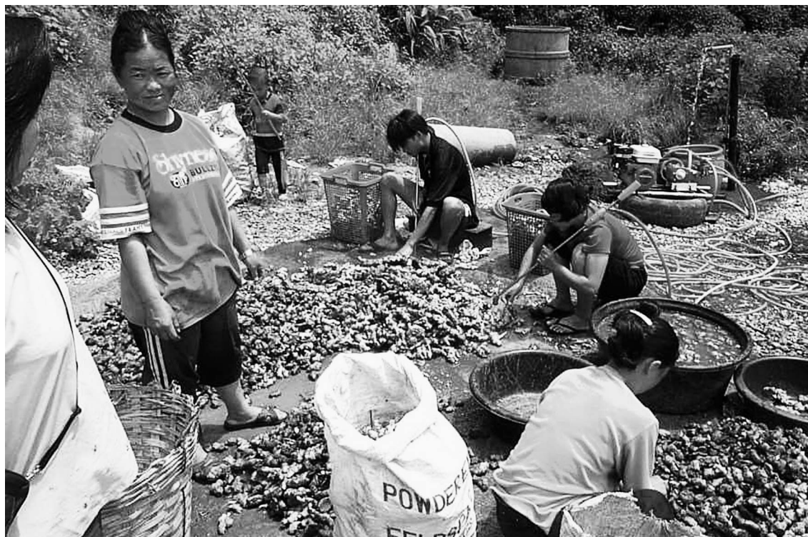
FIGURE 1 Hmong villagers in Nong Hoi washing recently harvested ginger. Ginger root was a traditional food collected in the forest; now it is a cash crop grown in permanent fields.

rented buffaloes to paddy rice cultivators. They ate the pigs and used the horses for conveying crops from fields to village. When times were difficult, they would sell the animals for cash or use them to barter for badly needed supplies. The present economy almost totally excludes raising large livestock, as there is virtually no forestland available for grazing animals.