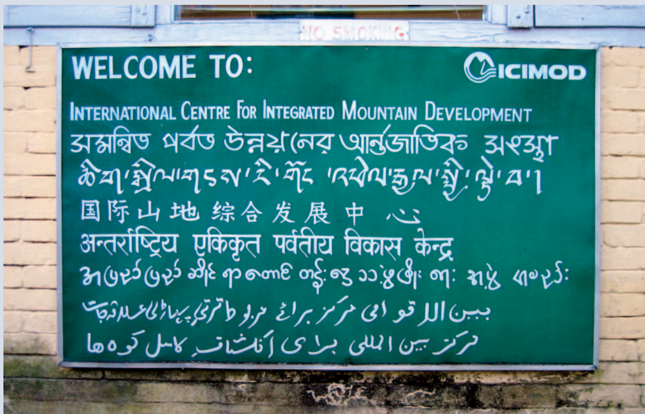
FIGURE 4 “Welcome to ICIMOD” in 8 different languages. The sign at the entrance to the main offices gives an indication of the multilingualism and linguistic diversity of the 140 staff.

Language revitalization campaigns aim to increase the prestige, wealth and